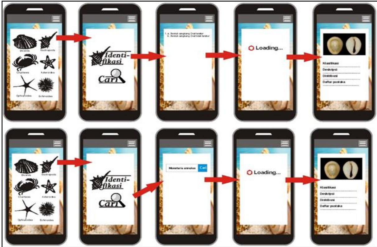
Figure 1. The displays of I-Invertebrata

been developed in this study. I-Invertebrata is an android application that serves to identify the types of Molluscs, Arthropods, and Echinoderms. The I-Invertebrata displays could be seen in Figure 1.