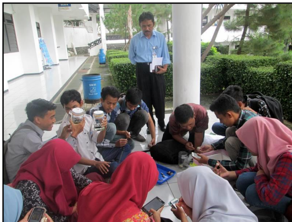
Figure 3. The main field testing step