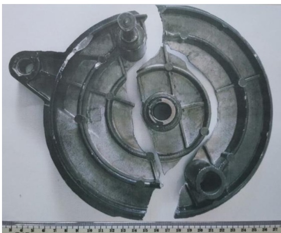
Figure 2. Broken component