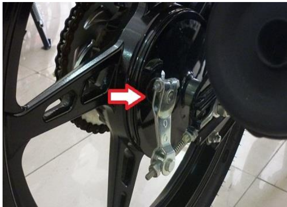
Figure 1. Braking system

Methods used to determine the occurrence of failed component are macro and micro observation, chemical composition, and testing of mechanical properties (7). Failure analysis of braking panel system of motorcycle are presented. Figure 1 shows the brake system component of a motorcycle. Brake panel/backplate is a failed component. This component has been repaired. After used in 3 months, the brake panel is fractured during braking process. From the result of the observation using digital camera, the obtained shape and fracture location as shown in Figure 2.