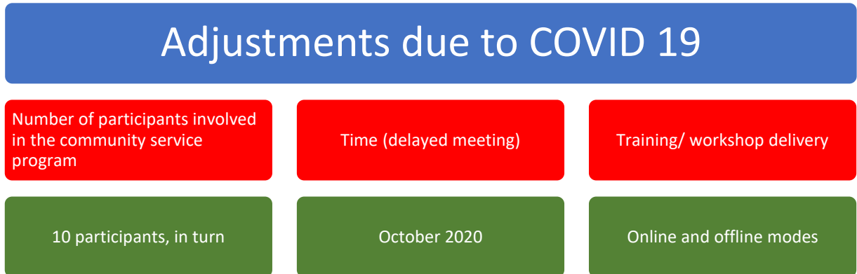
Chart 3. Program Adjustment due to COVID 19

The summary of such adjustment can be observed from the following graph: