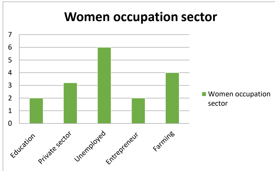
Chart 1. Women occupation sector in RT 03 RW 02 Sumbersekar, Dau Malang

The present community service provides training on patchwork. The reason why patchwork is selected because the patchwork is not only able to give space for the participants to be creative, but it also offers a chance for the participants to get income by selling their patchwork products. Moreover, patchwork which is made from leftover fabrics is seen as a way of recycling program. It is because those left over fabric can be value-added by transforming them into patchwork blanket, bed sheets, tablecloth, etc. T