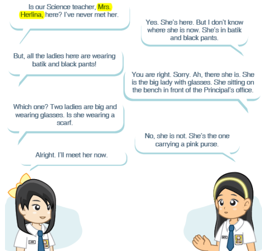
Figure 7. Illustration with Honorifics preceding Surnames

From figure 7, there was honorific Mrs. which refers to married women or one who has higher status in society. In the textbook the writer describes her as science teacher in the school.