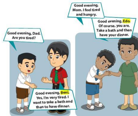
Figure 8. Illustration with Character's Name

Based on the result of data analysis, it was found that there were 309 names. Furthermore, out of 309 characters, there were 150 (49%) male named and 159 (51%) female. The characteristic of name was the term used to identify the characters like Lina, Beni, Udin, etc. the example can be found on page 7: