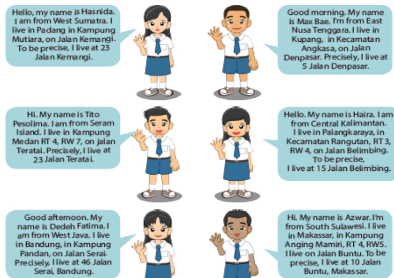
Figure 3. Illustration Male and Female

These quantitative percentages analysis showed that there was gender bias on the male's sides with different is 8%. However, qualitatively, the writer tried to describe the characteristics of female and male. Females are described with curly or long hair, ribbon, or veil/hijab. Males, on the other hand, were shown with straight or curly short hair. They are emphasized in local appearances that show Indonesian culture. For examples, there were illustrations about female and male students on page 22.