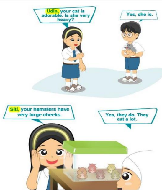
Figure 1. Main Characters