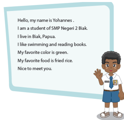
Figure 4. Male Illustration with different Traits

The male illustration is identified with different traits. For example, Yohanne from Biak, Papua has brown skin and curly hair. Meanwhile, Tito (on page 22) from Seram Island, Medan has white skin and straight hair. The female illustration is identified with different religion values. For example on page 28, Siti who wears veil or hijab with long skirt and shirt; while Annisa (on page 30) does not wear long outfits and veil.