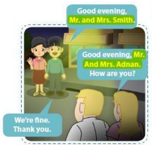
Figure 6. Illustration with Honorifics preceding Surnames Table .5 Tittle Names