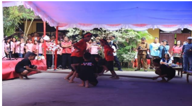
Figure 3. Students from Both Schools Perform Regional Dance (personal documentation)

the different religions. The series of cultural attractions (Figure 3) displayed by students of both schools can be interpreted as cultural transmission. Besides, teachers can also become cultural transmitters (Astuti, 2016).