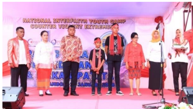
Figure 2. Panas Pela of Education by both schools (personal documentation)

Education is considered the suitable media, and young people (students) are considered potential cadres to accept the values of peace and fraternity from the local wisdom of Pela Gandong. According to Rev. Jack Manuputty and teacher (Ustadz) Abidin Wakano, young people can be a cadre of peaceful provocateurs (Tuwanakotta, 2017). Therefore, the Panas Pela of Education conducted by the two schools is a form of Pela Gandong culture transmission.