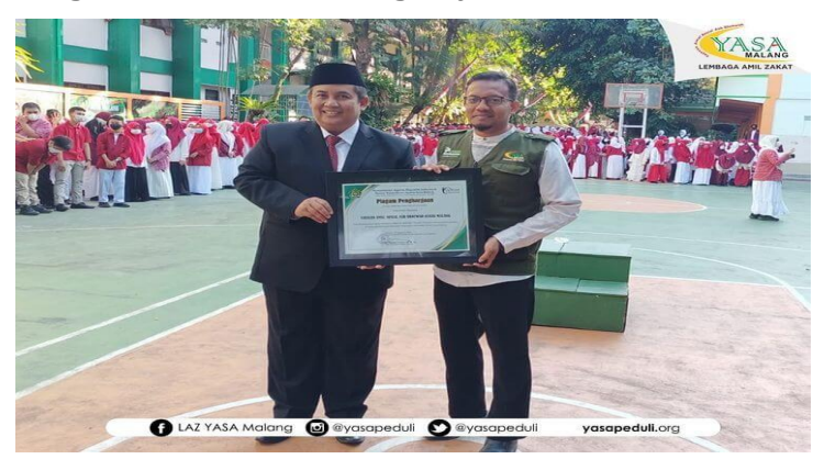
Figure 5. LAZ YASA Malang Got Appreciation from the Ministry of Religion Affairs Regional Office Malang City in the Last Ceremony of Indonesia

appreciation proves that LAZ YASA Malang is credible enough to be government and another institution collaborator. The Figure below shows appreciation from the Ministry of Religion Affairs Regional Office in Malang City.