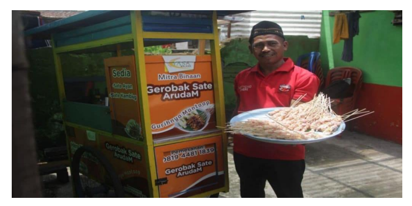
Figure 3. LAZ YASA Malang Helps the Low-Middle Business

For another example, the program of economics empowering helps some lowmiddle businesses with the latest 2021 total nominal IDR3.300.000 (LAZ YASA Malang, 2022: 36). This program also includes monitoring, business training, and religious training for at least six months. The Figure below this is one of the low-middle business who gets help from LAZ YASA Malang.