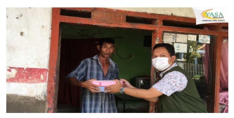
Figure 1. LAZ YASA Malang Distributed Ready-to-Eat Eals for the Elder

LAZ YASA Malang also evaluates all programs at the middle and end of the year. The evaluation aims to analyze what variables make the programs succeed or fail (LAZ YASA Malang, 2022). The goal from that can repair the weakness and develop the strength in all programs next time. The figure below shows the middle-year evaluation done by LAZ YASA Malang to evaluate all programs.