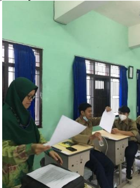
Figure 2. Researchers Distribute Questions

The Figure 2 shows that the researcher collaborates with the mathematics teacher to distribute questions to students who are the research subjects, because it is still in limited face-to-face learning, the mathematics teacher enters and assists in the class. The giving of this question will take place on September 19, 2021.