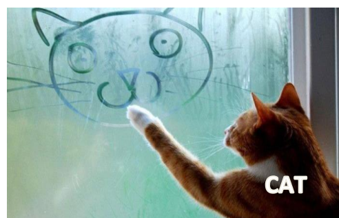
KACA – cat – GLASS