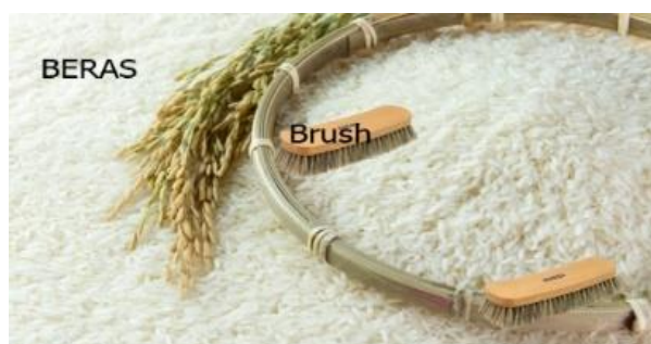
BERAS – brush – RICE

Consider a few examples from Indonesian and English vocabulary below. In Indonesian, the word "beras" (pronounced bəras:f ) means "rice" in English. It contains a sound that resembles the English word "brush". Employing the Indonesian word "beras" as the new word with the keyword "brush", learners can potentially form mental imagery of the keyword "interacting" with English translation like using "brush" to wash "beras" or two brushes on the "beras" (See Figure 1). Another example is the Indonesian word "kaca" (pronounced something like "kæca") that has similarity with "cat". Using the new word "kaca" as the Indonesian word with "cat" as the keyword can generate the relevant mental imagery for learners; they might imagine "a cat looks herself in the glass"