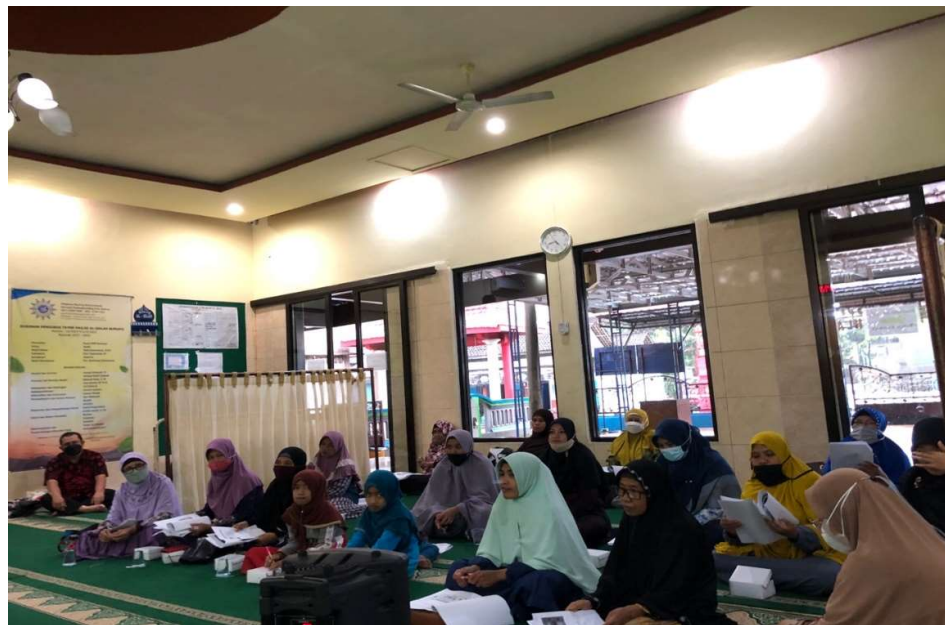
Figure 2. Photo of participants