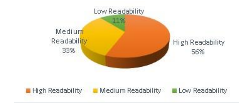
Figure 2. Readability Aspect of Description Techniques

information presented. Furthermore, based on the results of the average value in each diagram above can be displayed in Figure 2