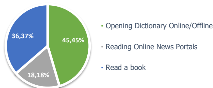
Figure 1. Strategies to Acquire Arabic Vocabulary

Vocabulary is very influential on other language skills. The amount of vocabulary produced by a person can reflect the intellectual level of that person. Rivers (Nunan, 1991: 117) states that vocabulary is important in order to be able to use a second language. Without a broad vocabulary, one will not be able to use the structure and function of language in communication comprehensively. Based on the results of the research conducted, it can be seen that there are various ways or strategies carried out by Sabili Islamic High School students to acquire Arabic vocabulary well and quickly. This is described as follows: