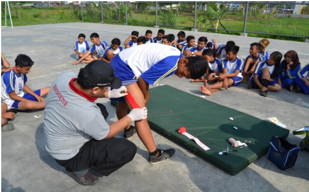
Figure 4. Kinesio Taping Assembly

In the implementation of education and training activities on sports injury management for SMPN 26 Malang students, it is known based on the results of the pre-test post-test evaluation that participants can take part in this activity well and enthusiastically shown by an increased knowledge as much as 75%. The results of this evaluation showed that the majority of participants had a fairly good understanding of the management of sports injuries using the DO RICE DON'T HARM method. This is an important point as the main goal of implementing this activity, due to the high number of cases of sports injuries in schools. Thus, training activities and sports injury management assistance are very crucial things to be given, especially to students and teachers, to be able to handle injury cases properly, appropriately, and effectively.