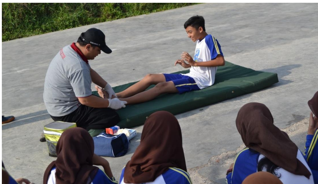
Figure 3. Limb Muscle Stretching Technique

The training activities carried out are in the form of training in leg muscle stretching techniques. This training aimed at relaxing injured muscles and aimed at improving muscle structure in patients with sports injuries (Figure 3). In addition, participants also practiced kinesio taping on injured knees, where this therapy aims to reduce pain that occurs in leg muscle injuries (Figure 4).