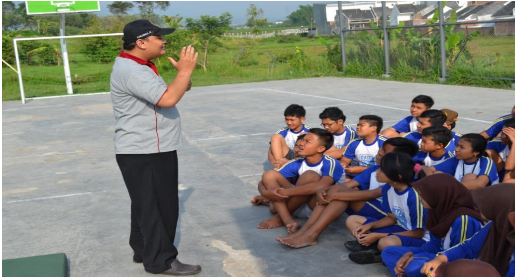
Figure 2. Presentation of Materials

Material delivery activities were divided into 2 stages. The first phase was for 30 minutes, the first material was about the types of sports injuries and the theory of how to manage them, while the second material given for 45 minutes, was related to the practice of technically managing sports injuries using the RICE and HARM methods (Figure 2). The media used were injury treatment equipment in the form of Ice packs, Ethyl Chloride, Kinesio Taping, scissors, mattresses, plasters, and others.