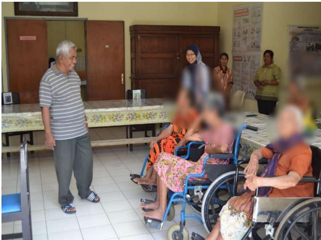
Figure 4. The first material delivery: elderly rehabilitation and health education

The activity on material delivery was divided into 2 steps. The first one, it was about elderly rehabilitation and health education (Figure 4), while the second one was about the practice on simple elderly rehabilitation to overcome health problem (Figure 5). The media used were laptop, LCD, whiteboard. Some obstacles found were the crowd outside the room that cause to distracting participants' focus.