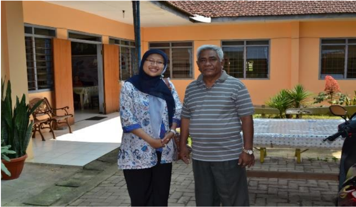
Figure 1. A picture with the head of management after an agreement of activities has been reached