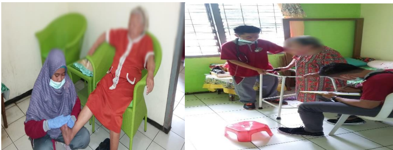
Figure 5. The second material delivery: practice on basic elderly rehabilitation

The practice on elderly rehabilitation is much needed as an effort to optimize the service to the elderly who are in need. The activity of direct practice is an opportunity for the caregivers to know more about the dynamic and reality of their working units. In addition, they can develop and improve the knowledge received as well as trying to find an innovation thus their role is maximum (Anggraeni, 2016).