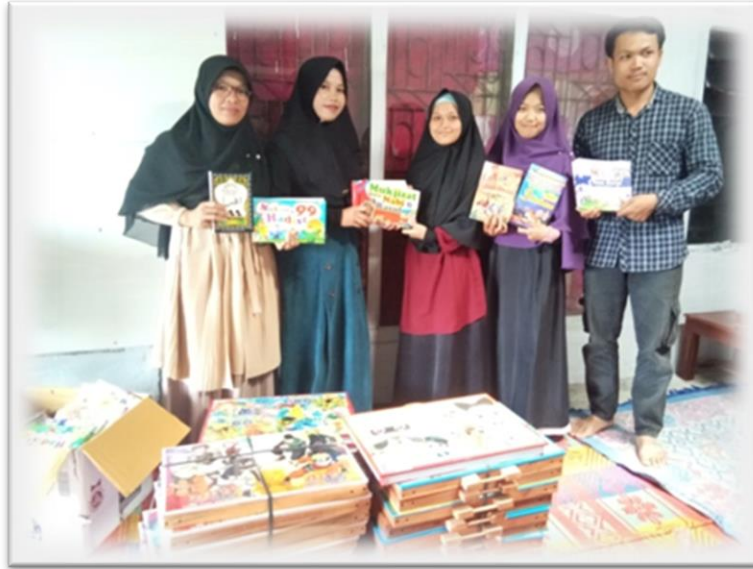
Figure 4. Donation of Arabic books, Islamic reading texts, and folding study table

It is observed that for children who is new to hijaiyah letters pronunciation, special repetition is needed. Also, an improvement is evident from one meeting to another that children are improved in term of confidence to come before the class and recite Arabic vocabulary, read the shahada correctly, as well as pronouncing Arabic vocabulary.