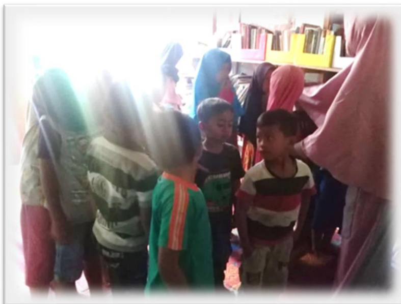
Figure 3. Learning through play

The children were in a great enthusiasm to participate in this community service, starting from welcoming the project team and responding well to the learning. Eventhough, initially not all children understand the Islamic material and Arabic. However, after several meetings, they gradually get used to write hijaiyah letters and remember some Arabic vocabularies taught. In addition, stories of the Prophets and His companions (shahaba) were also slowly understood, thus, the lesson they learnt can be practiced in their everyday life.