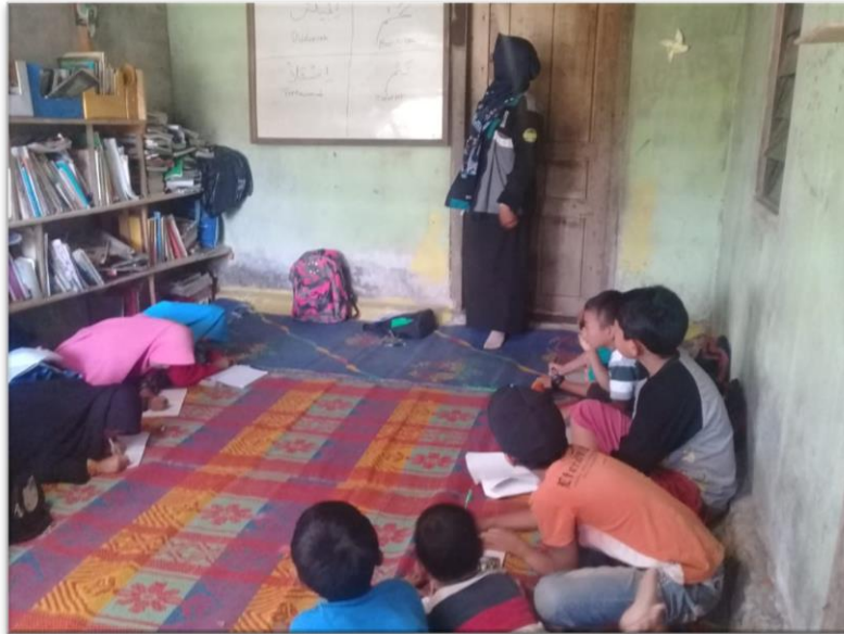
Figure 2. Learning Activities