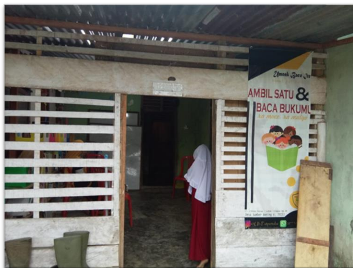
Figure 1. Umeak baco

This community service was scheduled on May to December 2019. This activity took place twice a month (fortnightly), thus, in 8 months there were 16 meetings. This community service was located at Umeak Baco Pat Petulai in the house of a resident of Sumber Bening Village Rejang Lebong, which had been used as a house for reading activities by children in the neighborhood (Figure 1). The target of this community service project is the children of Umeak Baco Pat Petulai Sumber Bening Village Selupu Rejang District Rejang Lebong Regency Bengkulu Province in total of 30 children.