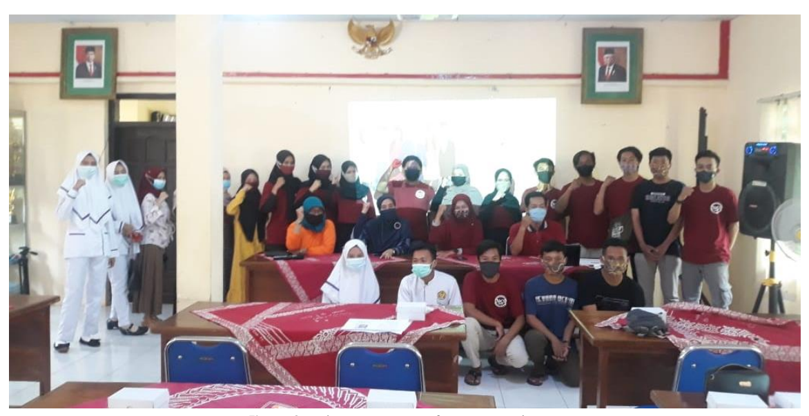
Figure 3. A documentation of participants' activities