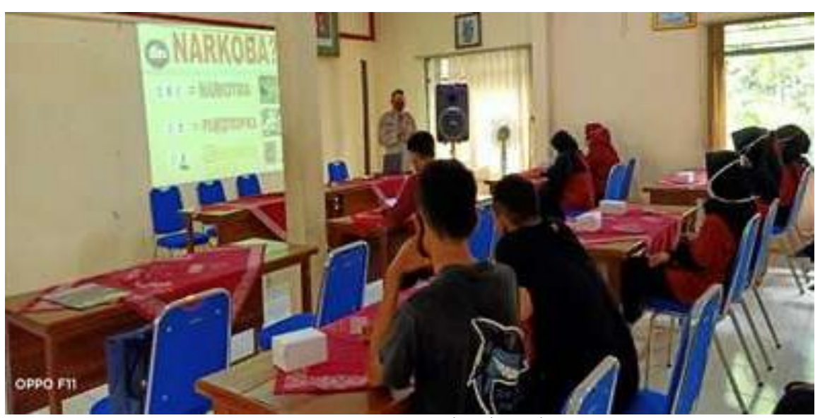
Figure 4. A presentation on drug abuse education

Upon entering the activity room, all participants fill in an attendance form and a form with 30 questions measuring their knowledge on drug abuse. As for participants' demographic profile, it is detailed in Table 1.