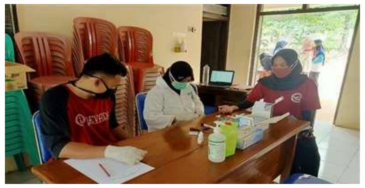
Figure 2. COVID-19 screening before the community service activity held

Before the activities, COVID-19 screening was undertaken to ensure that participants were free of virus transmission. As for documented events, it is presented in Figure 2.