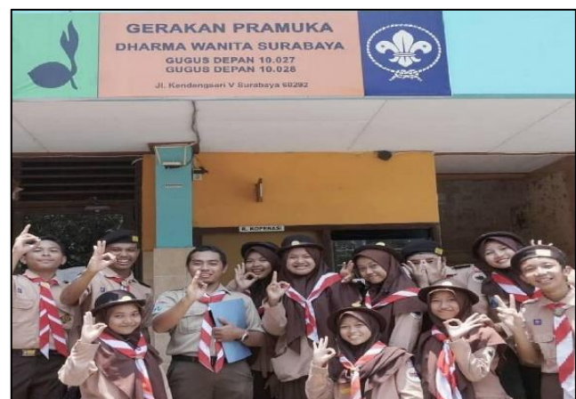
Figure 3. Scout administrators of SMADHANI