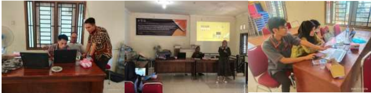
Figure 3. The implementation of training logos design for community service at Sungai Kunyit

The second day of the dedication was continued with the practice of a logo design workshop using the image editor software that had been provided and installed for all participants (Figure 3). Participants before the activity started were given information to use their respective laptops complete with a mouse so that the design workshop could run smoothly. For the first exercise, an example of a basic design is given, then if the participants understand the technicalities of using the Adobe Illustrator image editor tool, participants can take advantage of the features/tools available in the software. Fundamental ethics are taught so that participants understand the concept of delivering the design of a product logo, what is conveyed in the design is easily understood by the deserving public, be it information marketing culinary products, services or selling goods. Furthermore, after the participants got the basics for making designs using Adobe AI software, they continued to implement logo designs for the products of the Sungai Kunyit local entrepreneur community. It can be seen that the participants who were selected for this activity were very enthusiastic in designing their product designs.