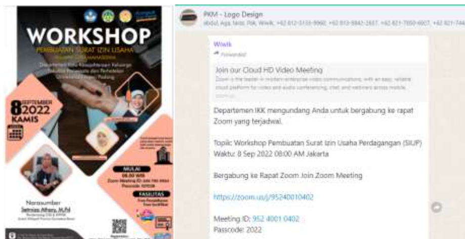
Figure 5. Flyer of Workshop for Making Business Licenses by FPP

This community service activity consists of logo design training in various media. It is possible that this logo design will be adapted for the development of e-commerce applications in the future. There are not only two-dimensional logos available, but also three- and four-dimensional logos, as well as augmented reality-based logos. The logo design will evolve in response to the needs of consumers and sellers as technology in the field of sales advances.