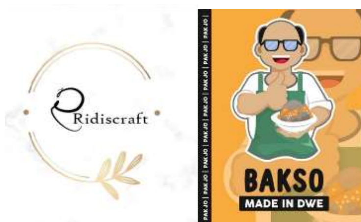
Figure 4. Example of logos design from participant

As an example of the logo work produced, there were two businesses, namely Bakso MADE IN DWE and Ridiscraft, one engaged in culinary and another business was in the field of selling goods. After being evaluated and presented the results of the participant's logo, suggestions for improvement was given so that the logo will be even better and more attractive in the future. Thus, the logo design workshop was achieved by increasing the participants' skills in using tools to design logos. Research reveals that brand logo has an impact on consumer's preference (Lieven et al., 2015)