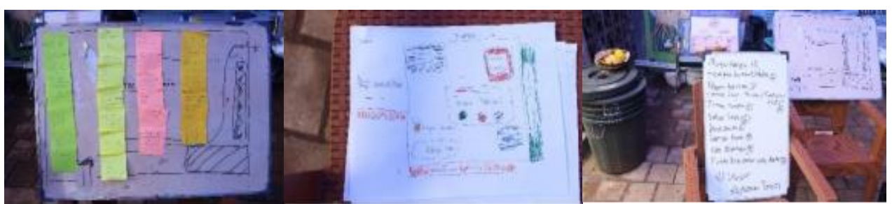
Figure 4. Land Planning and Decorating the Garden with Ecobrick Products.

Petrochemical plastics are produced but these substances are not ecologically suitable. Scientific studies show that these chemicals are toxic to humans (Apriyani et al., 2020). This is known when the smell of plastic combustion occurs. When these substances dissolve into the soil and water and air over time, they are absorbed in absorbed plants and animals causing damage to the soil, water, and air. Plastic waste that is disseminated, burned, or disposed of produces toxic substances. Even TPST (Integrated Landfill) engineering cannot be a successful solution. These chemicals will eventually enter the biosphere and affect the lives of livestock and humans within ten years or even a hundred years. The documentation of this program can be seen in the Figure 4 and Figure 5.