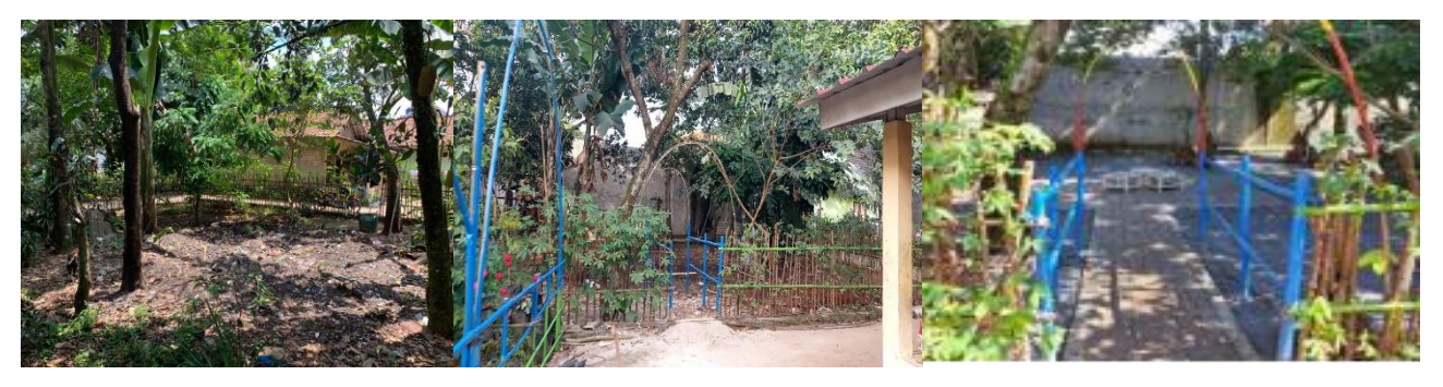
Figure 5. Results of Land Arrangement and Garden Decoration Activities Before and After Renovation

environment. The researchers found that the effect of cold on the human body is the absorption of chemicals formed from plastic materials into the human body. In the United States and Europe, chemicals such as Biphenyl A and Phalates are now banned. But in the Philippines and in other Asian countries the chemical is still common (Leria et al., 2020). Even a small amount of this chemical causes allergies, hormonal imbalances, cancer, and acute poisoning in humans. These chemicals cause allergies. The parties most susceptible to unfavorable effects are young children. Petrochemicals combine to form dioxins when plastic is burned (Istirokhatun & Nugraha, 2019). Dioxin pollutes the air through smoke and soil and water through the soil. Dioxin is a destructive poison.