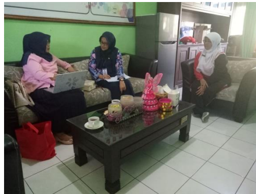
Figure 2. Coordination of targets and conditions for students with the Deputy Head of the Curriculum of SMPN 16 Malang