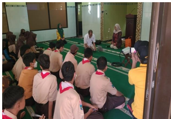
Figure 10. The Second Training “Strengthening Creative Writing Skills” which took place at the SMPN 16 Mosque in Malang