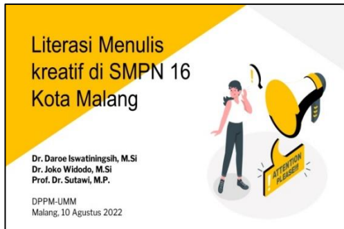
Figure 3. Presentation prepared for the first training on August 10, 2022

reinforce students who wrote and were still interested in writing. The next possible time to implement the second training was November 11, 2022, with 78 students as participants and conducted in the school mosque. The result of this second training was that many students submitted and corrected the writings that had been submitted. As many as 87 works were submitted, and 81 writing pieces were eligible to be published after being selected. Figures 3 and 4 illustrate the presentation used in the first and second training.