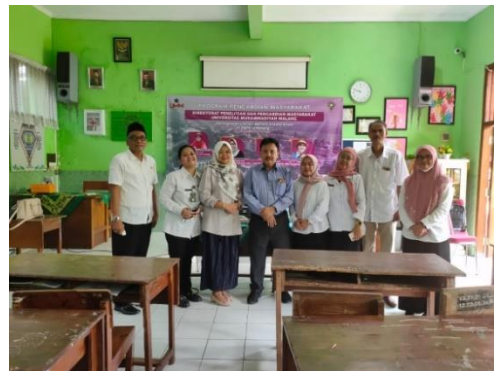
Figure 6. A group photo with the teachers from SMPN 16 Malang at the end of the activity