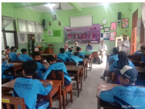
Figure 7. Groups of Grade 8 Phase II students participating in creative writing training