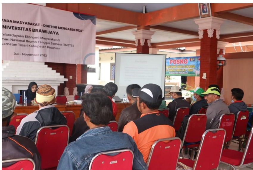
Figure 2. Forum Group Discussion with farmer groups in Tosari District

The participation of approximately 20 farmers, who are also part of farmer groups, is also promising as it helps ensure community involvement in the service activity and effective coordination among them regarding production inputs. Involving key stakeholders such as farmers in the FGDs can also help identify the most pressing economic problems facing the community, as well as potential solutions that are relevant and feasible. Overall, the success of the Doctoral Service activity depends on the engagement and collaboration of all stakeholders involved, including the service team, community members, and local officials. By working together, it is possible to identify and address the economic problems faced by the people of Tosari and promote inclusive and responsive sustainable development that addresses the needs of the local community.