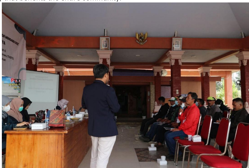
Figure 3. FGD session with farmer groups in Tosari District

The assumption that larger farms do not need to be part of farmer groups may also hinder increasing membership. It is important to recognize that even large farms can benefit from the resources and support provided by farmer groups, such as access to inputs, training, and market information. Encouraging more farmers, including those with larger farms, to join farmer groups can help strengthen the overall agricultural sector in the area. Overall, the information obtained through the FGD session can help inform the development of targeted interventions that can support the economic empowerment of the Tosari community, with a particular focus on agriculture and tourism. By building on the existing strengths and addressing the barriers to participation, it is possible to create a more inclusive and sustainable economic development strategy that benefits the entire community.