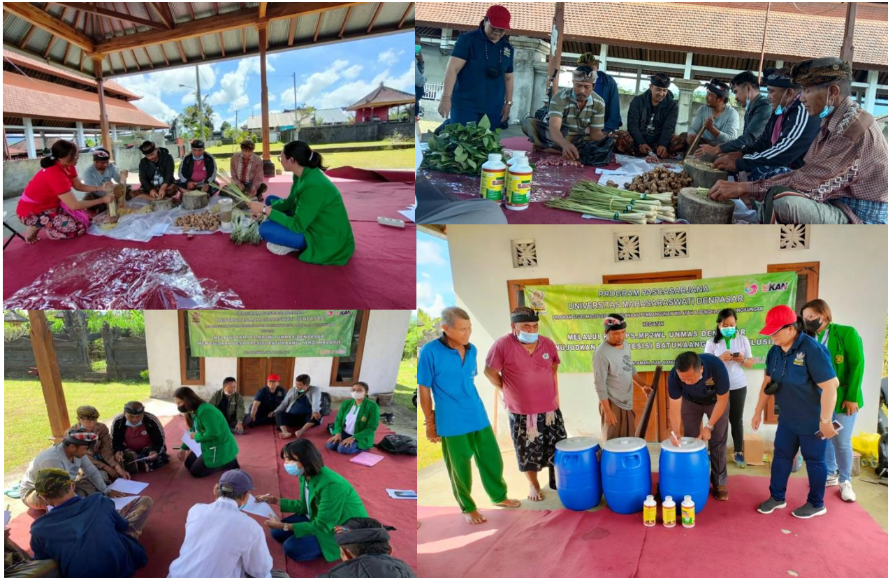
Figure 3. Producing organic fertilizer and plant-based pesticide