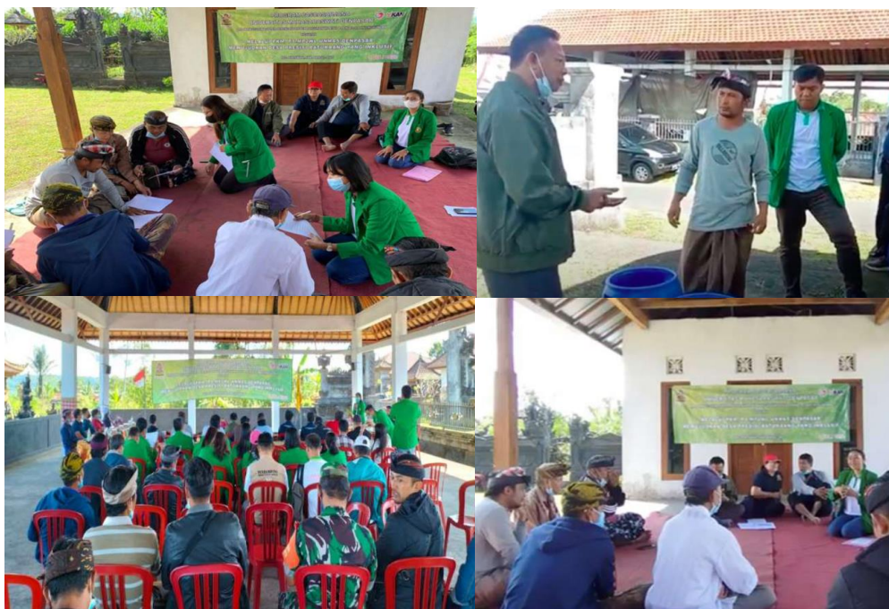
Figure 1. Campaign and learning about the organic fertilizer and pesticide

The pre-test results showed that the majority of participants knew what organic fertilizer meant, but only half knew what ingredients could be used as organic, and most did not know about bio urine or plant pesticides. After socialization and practice on the use of organic waste in the manufacture of organic fertilizers and plant pesticides, all participants learned about organic fertilizers, bio urine, and plant pesticides. Commitment to the community through the demonstration of organic fertilizer production plus plant pesticides improves the group's skills in producing organic and plant-based fertilizers that can be used to improve the productivity and quality of the orange and coffee crops grown in Batukaang Village (Suanda, Budiasa, Suta, Ariati, & Widnyana, 2021).