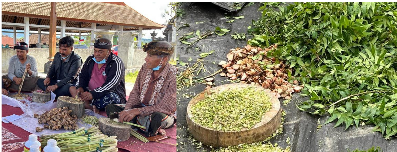
Figure 2. Preparing material for producing plant-based pesticide

Pesticides derived from red onions Plant pesticides are used as an alternate control to address the issues of pesticide resistance, toxicity, and inefficiency in pesticide application. Furthermore, plant pesticides are more environmentally benign, ensuring that the ecosystem remains balanced. Plant insecticides derived from red onion skin waste components could be used to control grey worms that damage plants (NP Putu Pandawani & Widnyana, 2021). Acetogenic chemicals found in high concentrations in red onions can diminish insect appetite, causing insects to avoid plants that have already been treated with red onion skin insecticides. Meanwhile, acetogenic chemicals in low concentrations might poison the pest's stomach, leading to death. Furthermore, the skin of red garlic contains squamocin compounds, which can interfere with the respiratory system of insect cells by blocking electron transport. The bug will then die slowly since it will not acquire nourishment (Layali Damanik et al., 2022). The elements in red onion skin, which act as pesticides, also offer additional benefits that can help plants grow.