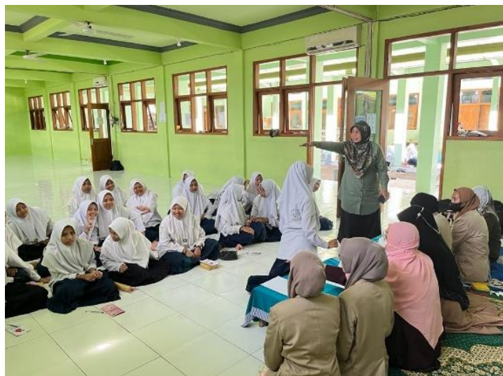
Figure 2. Educational session

This analysis was conducted to determine the impact of the intervention, which involved an educational lecture on hemoglobin, on the knowledge of female students at IBS Roudlatul Musthofa. The Figure 2 was collected during the educational session.