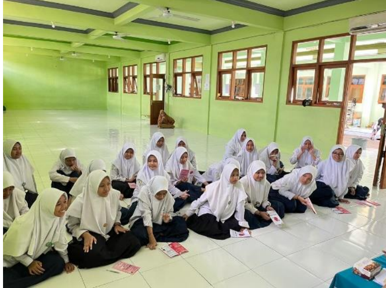
Figure 1. Students of IBS Roudlotul Musthofa

The implementation involved educational sessions on hemoglobin tailored to address the specific issues and conditions of IBS Roudlotul Musthofa (Figure 1). These activities were carried out from May 8 to May 19, 2023, with the main awareness session conducted on May 15, 2023. The events took place at Pondok Pesantren Roudlotul Musthofa in Pundensari Hamlet, Rejotangan Village, Rejotangan Subdistrict, Tulungagung Regency.