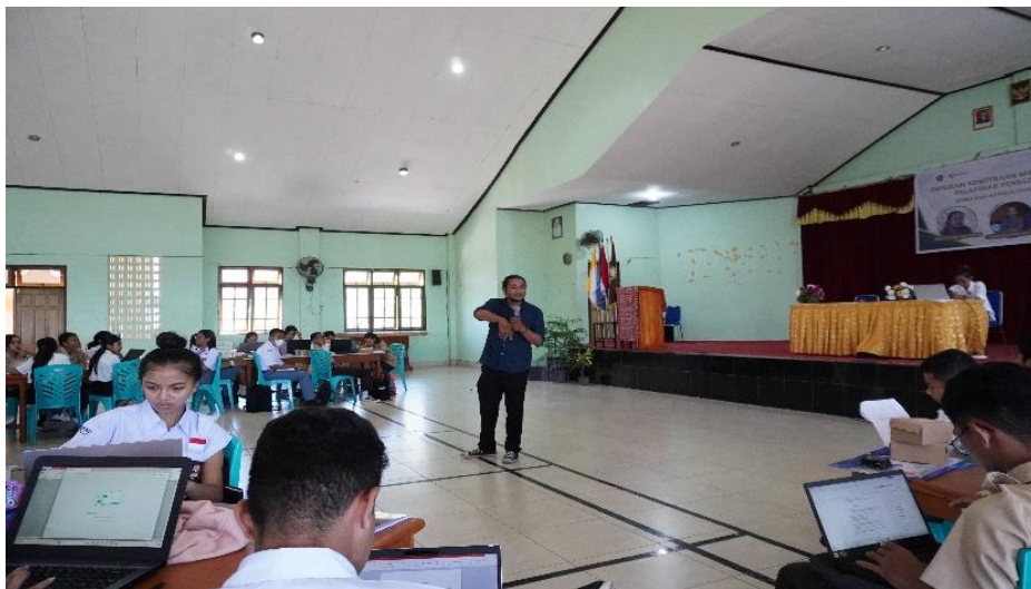
Figure 3. Delivery of Materials to Participants