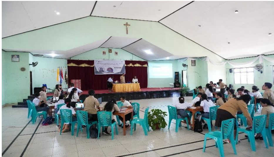
Figure 2. Activity opening

insight so students can make research and formulate it in a research report. In addition, mentoring activities are also used to share problems faced by students and individual problems in conducting research. The mentoring program is carried out 3 times in accordance with the partners' agreement to provide assistance in the formulation of research problems and references used in writing research reports.