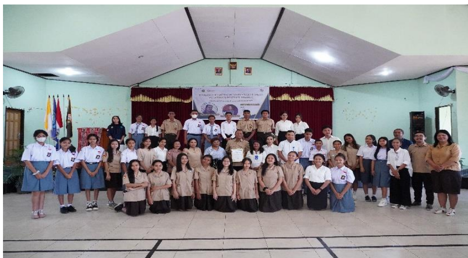
Figure 5. Team with Partners After Awarding the Certificate