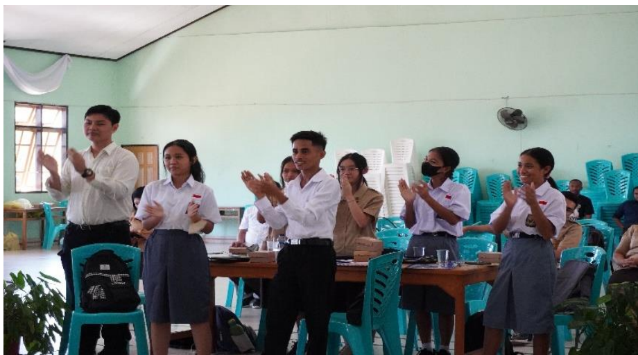
Figure 4. Intermezzo /Icebreaking