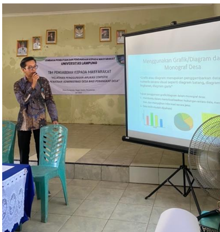
Figure 1. The process of brainstorming

In this stage, visits and observations were conducted to assess the needs of the community, especially village officials and village cooperative managers, regarding the use of statistical applications. This stage was also used to map the current state of village administration. The preliminary activities took place in April 2023 as the initial phase to implement community service.