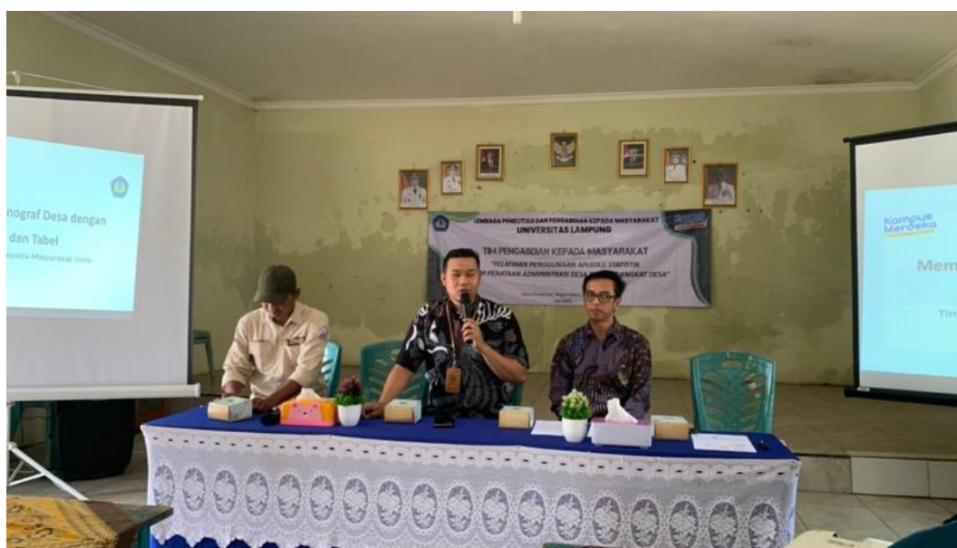
Figure 2. The implementation of community service

After formulating the training stages to provide solutions to the issues and challenges faced by village officials, the community service team conducted awareness and training sessions on the use of statistical applications for village officials and village cooperative members in Purworejo Village, Negeri Katon Subdistrict, Pesawaran Regency, specifically on using SPSS for statistics. The activities are depicted in the Figure 2.