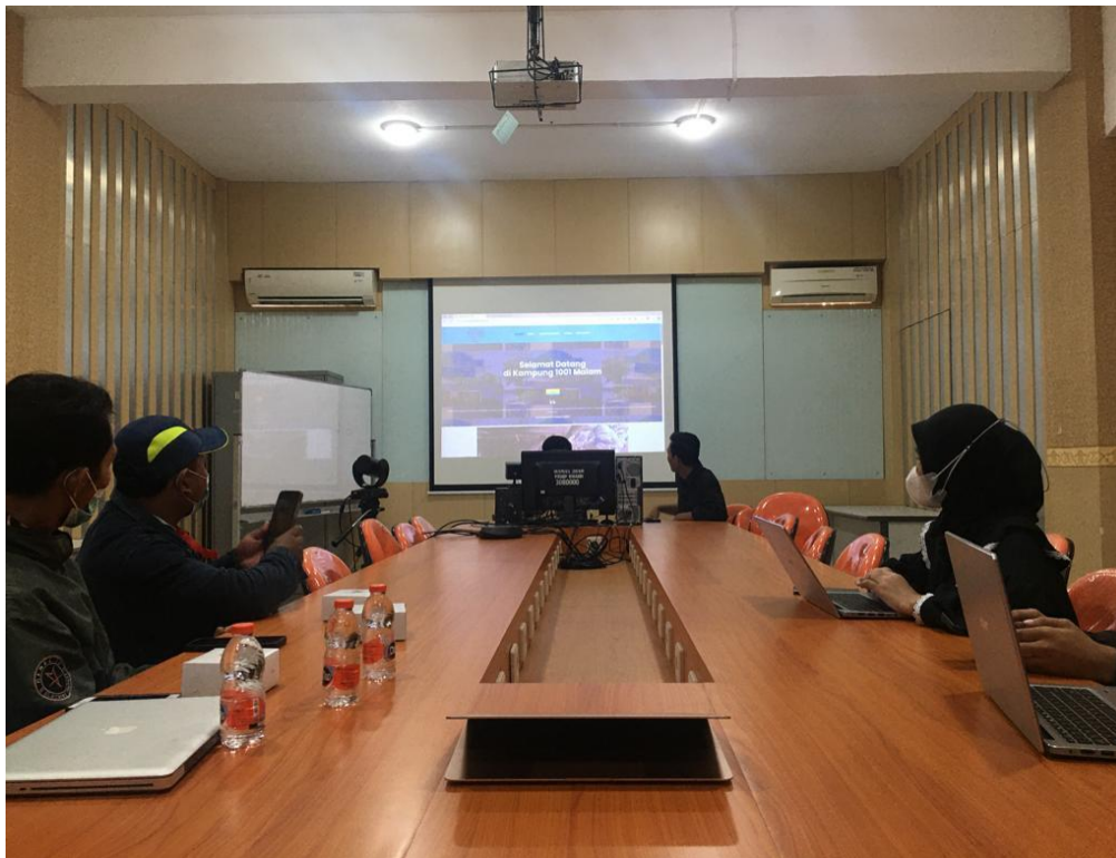
Figure 7. Introduction of the website architecture

One of the strategies in improving the quality of an effective website such as good web content and necessary navigation is through information architecture (Bahri et al., 2022). Which contains information in the form of charts, columns, or structured designs that are interrelated so that it is more easily understood by others. A good website has a collection of information consisting of interconnected web pages either dedicated by individuals, groups, or organisations (Rochmawati, 2019). Thus, giving a quality impact on the image that is built. Effective website quality also directly impacts information about the activities and development of the Kampung 1001 Malam and product promotion on the website. However, because the knowledge of the Kampung 1001 Malam community regarding the structure and optimisation of the website is still lacking, the website information architecture (design) socialisation program needs to be carried out by means of training in understanding and creating a quality and effective website design structure in supporting their needs in the aspect of information dissemination facilities and product promotion. The main target in the implementation of this activity is the productive age community by introducing the contents of the structure and menu functions available on the website so that they can maximise the functions of the available features (see Figure 7 and Figure 8).