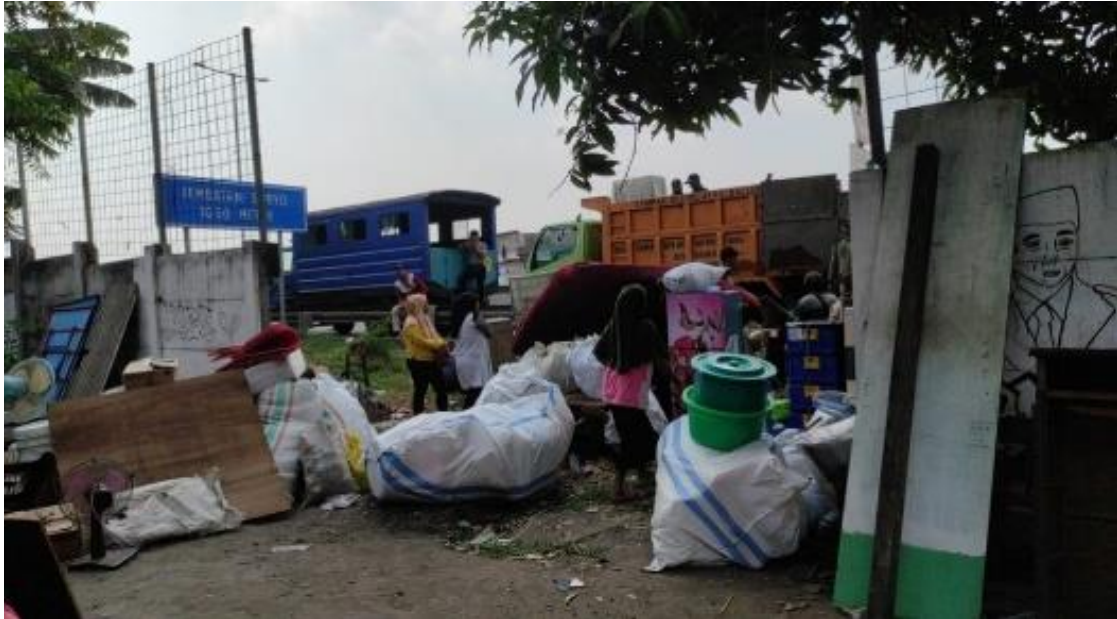
Figure 3. Relocation Situation

The relocation situation creates significant adaptation challenges, especially for the entire community of Kampung 1001 Malam. Further efforts to understand the relocation conditions, the next preparation is to conduct a survey in the Rusunawa Benowo area, Pakal which is one of the relocation areas by identifying social conditions, facilities, and post-relocation community activity plans (Figure 4). In the survey and interview process, information was extracted regarding the efforts made by the government and related organisations on post-relocation mitigation of the Kampung 1001 Malam community. These aspects include the establishment of programs in the rusunawa to help them adapt to the new environment. The results of the survey and interviews will be the basis for the formation of the website in the service project to determine features that are in accordance with existing conditions.