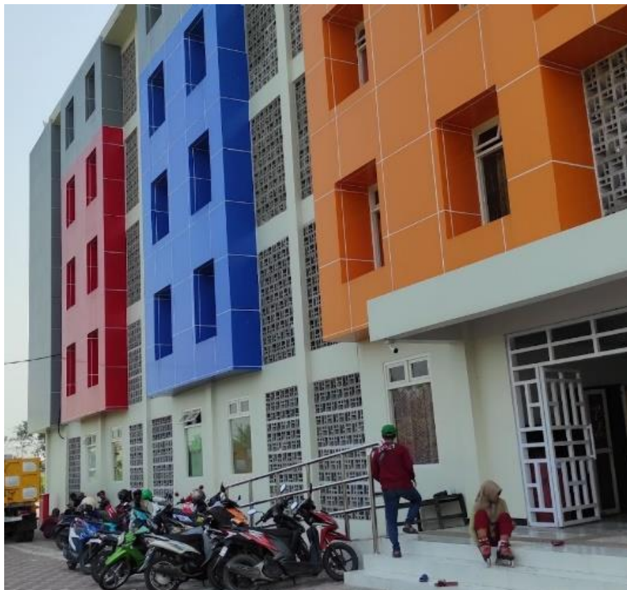
Figure 4. Rusunawa Benowo, Pakal