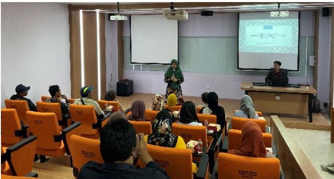
Figure 10. Department representative's speech