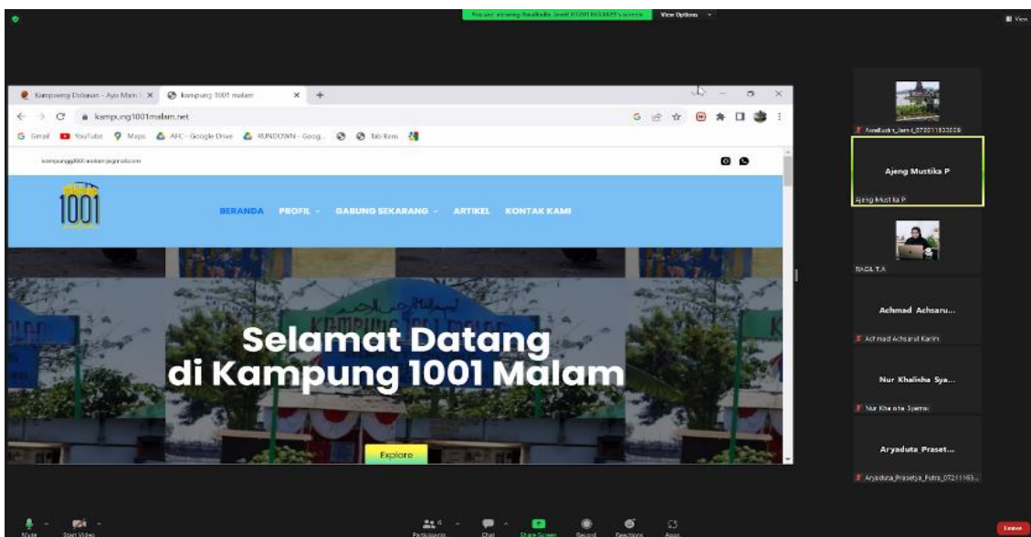
Figure 5. Website Development Discussion