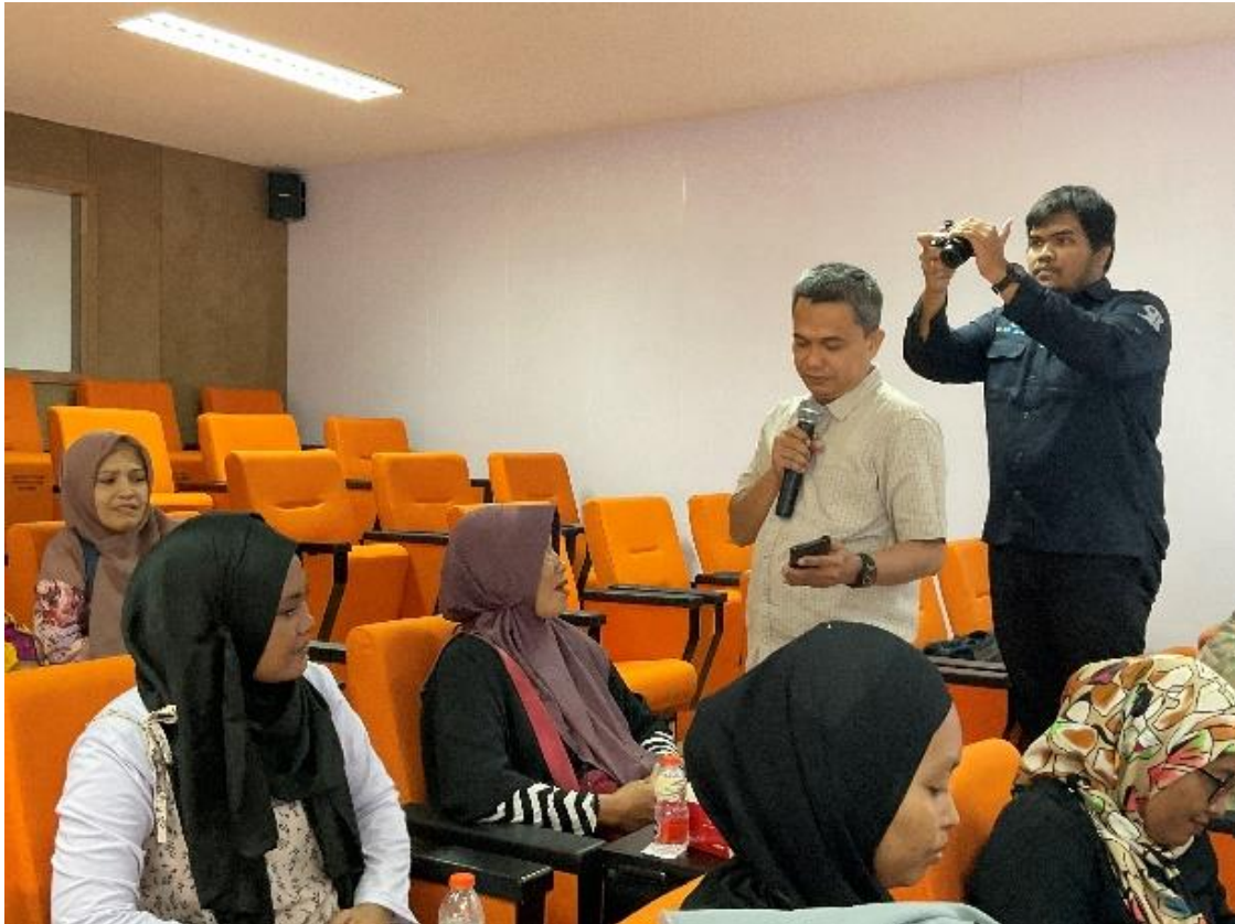
Figure 9. Socialisation for 1001 malam

Along with the rapid development of technology, users are required to master science and information technology. Information technology is one of the main factors that support the effectiveness of society in facilitating all activities in everyday life. Technology is increasingly of various types. This is not limited to one of its functions, namely as a means of promotion and information, especially in the field of websites which currently play an important role in the aspect of delivering up to date information. This socialisation also explains about the website as a media used as a means of marketing, promotion, information, education, and communication because it is easily accessible to various levels of society in various regions using only internet access. The website as a medium to introduce the various potentials and advantages of a product is also related to information in sharing all information in an effort to brand something to the wider community (Figure 9 and Figure 10).