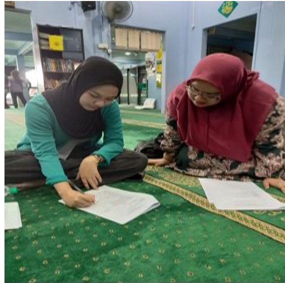
Figure 4. The head of the service team helps one of the counseling participants fill out the post-test questionnaire