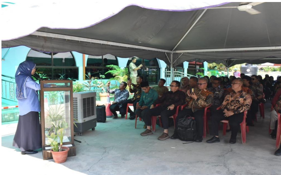
Figure. 1. The SoG Dean gave a speech and opened international service collaboration activities