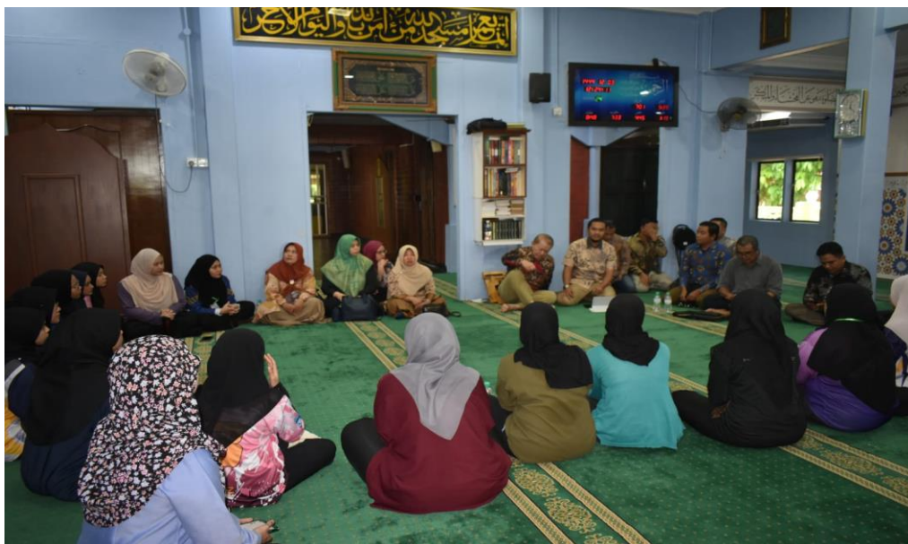
Figure 3. Discussion session between the service team and extension participants

After the counselling material is delivered, the next activity is a discussion (Figure 3). On this occasion, participants were asked to submit their questions. The questions submitted by the participants were responded to by the presenters and members of the service team interactively. The questions asked by the participants showed that the extension participants had sufficient knowledge and were even interested in managing assets owned by Singkir Darat village in general. However, there were obstacles in asset management experienced by the Village Government. One of the obstacles experienced is that the capacity of government officials to carry out administration still needs to be improved. Next, manual asset management has information that is not integrated, so assets are not presented comprehensively. This situation causes asset management officers in the village government to experience difficulties in carrying out the administrative data collection process and limitations in utilizing assets efficiently and economically.