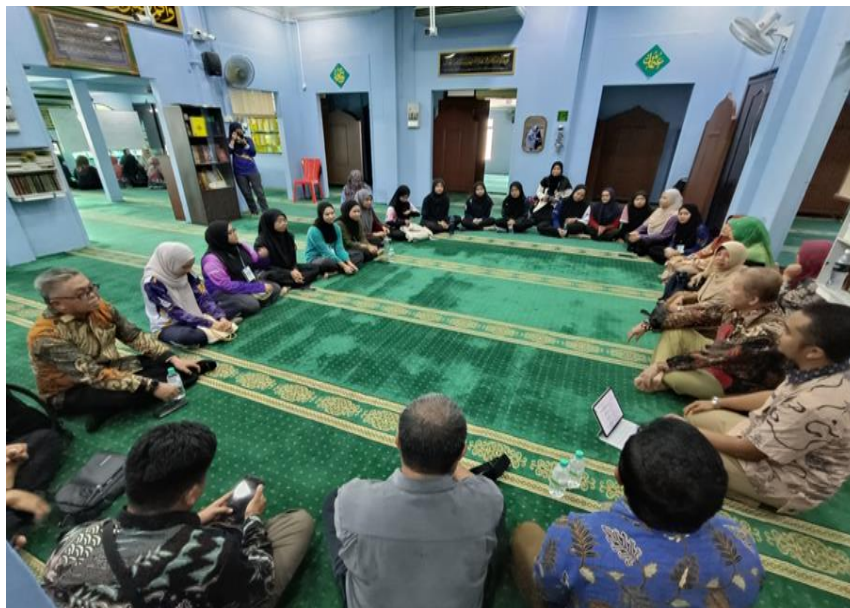
Figure 2. Counseling participants enthusiastically listened to the presentation material presented by the service team

The manual system still used at the Singkir Darat Village Office is still using Microsoft Office, namely, Microsoft Excel. The use of Microsoft Office Excel in recording expenditures and entry of goods can be categorized as a process that is still manual because the application has not been used, so there can be discrepancies between the information obtained and data loss caused by human error (Azbihardiyanti, 2020). An application-based information system can be an innovation created for smooth asset management in the village. The village asset management system can be an application that records the administration of village fixed assets, from planning, holding, and administering to submitting complete reports with codification and labelling of fixed assets based on predetermined rules. The aim is to regulate asset ownership to minimize the risk of loss of village assets and make it easier for the village head to present reports on fixed assets owned by the village office, as well as an information system that helps village officials in carrying out fixed asset management which records the administration of village fixed assets from planning, holding, administering to submitting complete reports with codification and labelling of fixed assets based on the rules set by the government.