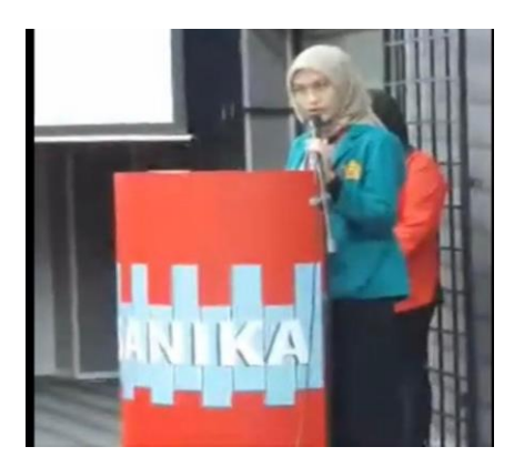
Figure 2. Collaboration between the Faculty of Economics Incubator Club (UKM INKUBATOR FEB USK) and UKM-CESMED Universiti Kebangsaan Malaysia.

The second stage of this student engagement activity involves networking opportunities or networking events. To enhance the student's competence, the UKM INKUBATOR FEB organized cultural exchange events, including cultural exhibitions, food festivals, and art exhibitions representing various cultural backgrounds (shown in Fig 3). The goal is to promote interaction and understanding among different cultures and create an entrepreneurial ecosystem. Ultimately, students are prepared to compete in business and succeed in the global marketplace. During the event in Malaysia, the students showcased a cultural exhibition that featured traditional clothing from various Acehnese ethnic groups. They also hosted a food festival, introducing well-known Acehnese products such as Gayo Arabica coffee, Acehnese cakes (boi, karah), and melinjo crackers. On the other hand, students from UKM-CESMED UKM presented Malaysia's local food products like cendol, traditional clothing, and handicrafts created by UKM students.