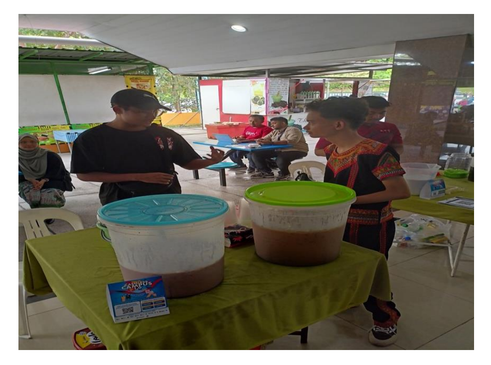
Figure 3. Networking Opportunities and Networking Events

The second stage of this student engagement activity involves networking opportunities or networking events. To enhance the student's competence, the UKM INKUBATOR FEB organized cultural exchange events, including cultural exhibitions, food festivals, and art exhibitions representing various cultural backgrounds (shown in Fig 3). The goal is to promote interaction and understanding among different cultures and create an entrepreneurial ecosystem. Ultimately, students are prepared to compete in business and succeed in the global marketplace. During the event in Malaysia, the students showcased a cultural exhibition that featured traditional clothing from various Acehnese ethnic groups. They also hosted a food festival, introducing well-known Acehnese products such as Gayo Arabica coffee, Acehnese cakes (boi, karah), and melinjo crackers. On the other hand, students from UKM-CESMED UKM presented Malaysia's local food products like cendol, traditional clothing, and handicrafts created by UKM students.