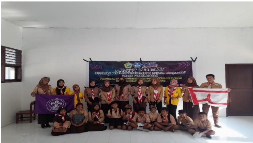
Figure 3. Cub Scouts of Bumi Bahari Gudup (Subject of Community Service)

Community service observation activities were carried out at Gudup Bumi Bahari on September 20, 2023 starting at 10:00 WITA. The number of participants was 42 participants. Meanwhile, the first community service activity was carried out on September 30, 2023 starting at 14.00 WITA. The number of participants was 10 participants who participated in the provision of material and practice of First Aid phase I (Figure 3). The second phase of service was carried out on October 21, 2023 at 14.00 WITA. With 23 participants who participated in the practice of making stretchers and interview sampling (Figure 4).