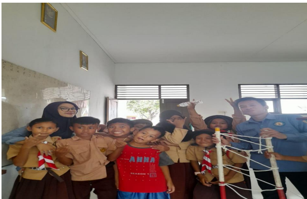
Figure 4. The practice of making a stretcher for first aid in accidents