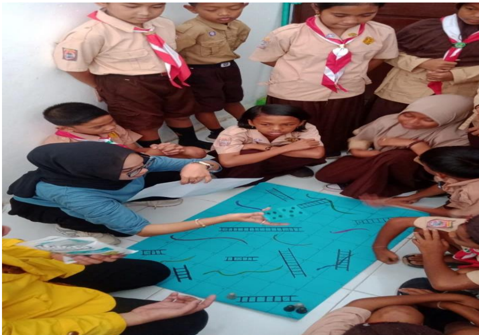
Figure 5. Game Interlude in Accident First Aid Practice

The patient pick-up game is carried out by dividing the participants into two groups, the patient group and the medical personnel group (Figure 5). The medical group acts as medical personnel who will perform first aid treatment on the patient group, the patient group will carry a card containing three kinds of accidents that have been taught. This game is also to assess the extent to which participants understand the material that has been taught and as a practical material after theory.