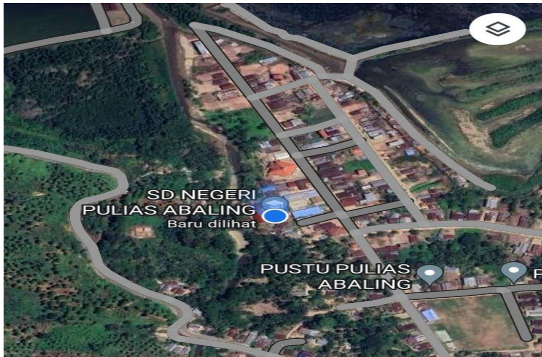
Figure 1. Location Map of Gudep Bumi Bahari in SD Negeri Pulias Abaling