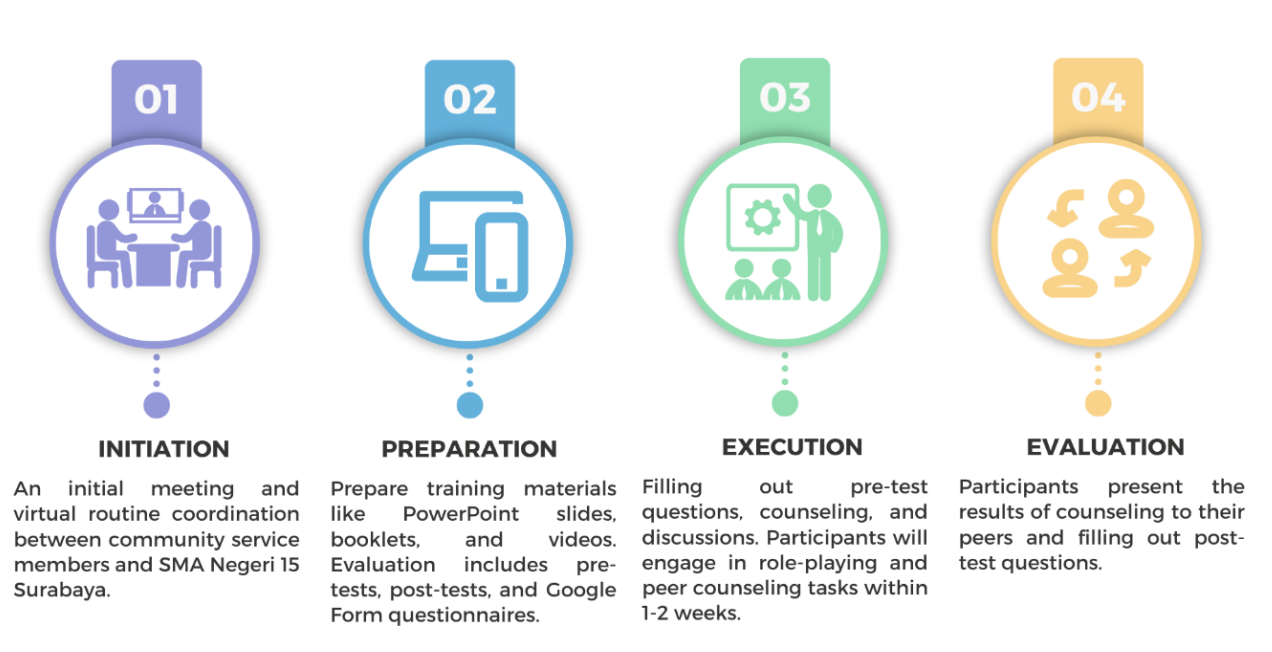
Figure 1. The stages of activity implementation and problem solving.

The activity was carried out using the training method, which was divided into two stages of implementation in August 2023. The location of the activity was SMA Negeri 15 Surabaya, with the target participants being 2 representatives of class X and XI students, totaling 48 students. The outline of how activities will be carried out to implement the methods was summarized in Figure 1.