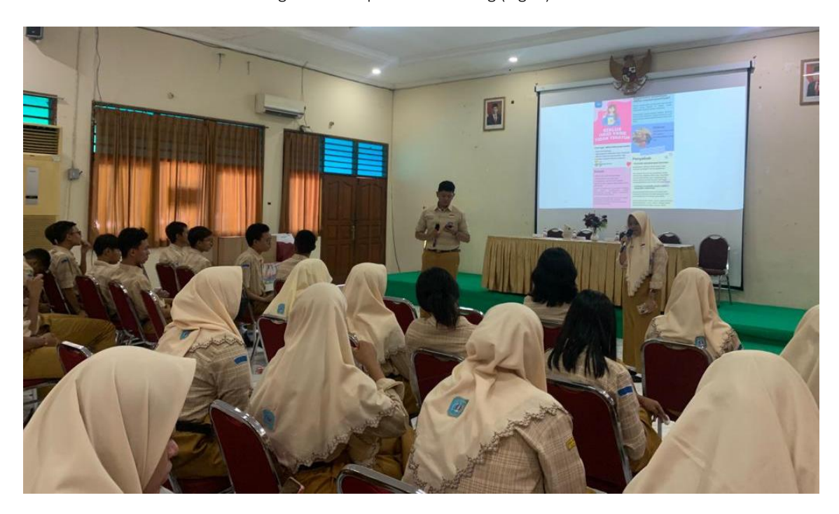
Figure 2. Peer counseling presentation by trainees

The second phase of the activity was held on August 23, 2023, and at this stage, the selected participants will present the results of the simulation that was assigned at the previous meeting (Fig. 2).