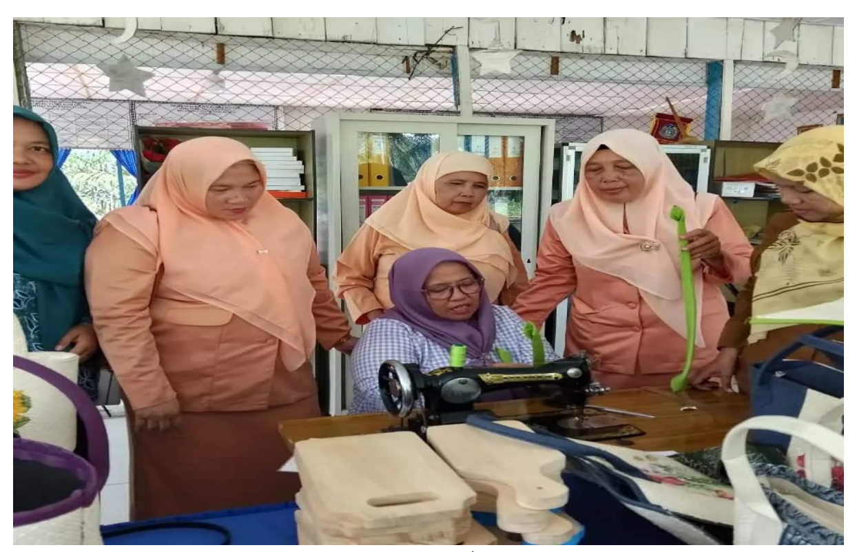
Figure 2. Decoupage Making Training

In the training session, participants learned intensively about the art of decoupage. The instructor guides them patiently through every stage, from selecting the drawings to the application techniques. In Figure 2, the instructor can be seen giving an explanation to participants on how to sew bag handle material in the context of decoupage art. After various training sessions, participants begin to apply the knowledge they have gained. They have experienced significant improvements in their skills and feel proud of the progress that has been made. This is reflected in the decoupage works they create, as seen in Figure 3, which amaze with their beauty and detail.