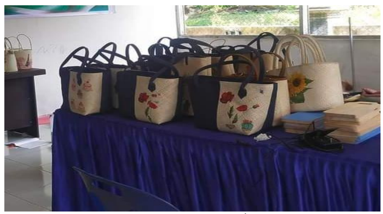
Figure 3. Decoupage Crafts

The production of Decoupage bags has increased over time. It can be seen in the Table 1. In the first week, participants successfully made 10 bags, showing initial adaptation to the manufacturing process. In the second week, the production number increased to 15 bags as participants began to understand the technique better. In the third week, there was a significant increase to 20 bags, as participants became more skilled and confident. This was maintained in the fourth week with the re-production of 20 bags. The cause of this change in production can be influenced by various factors, such as the level of expertise of participants, experience, and their level of understanding of the material.