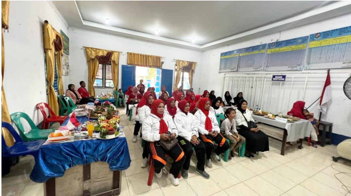
Figure 2. MSME Counseling Based on Local Potential

With the synergy between the government and the community, it is hoped that Percut Village and the surrounding area can continue to grow and become an example in community empowerment based on local potential. This will not only improve the welfare of the community, but will also strengthen the identity and sustainability of local development as a whole. Thus, it can be concluded that through proper counseling and support from the government, the people of Percut Village have been able to better recognize and utilize their local potential, paving the way to sustainable and inclusive development for all levels of society.