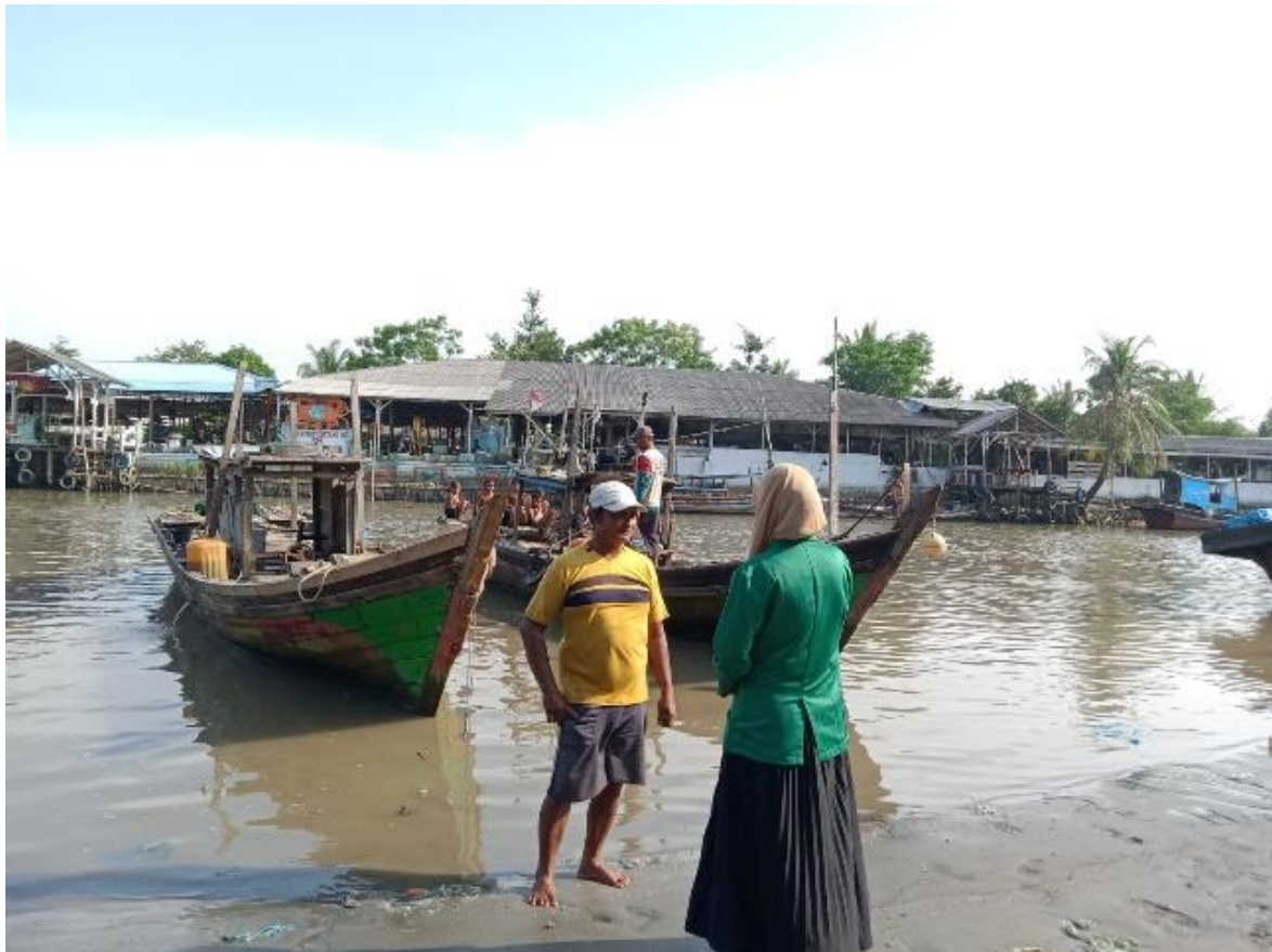
Figure 1. Local Potential of Percut Village

Based on Figure 1 This village is also known to have a variety of typical food places that are not small, the location is not far from residential areas so that it allows direct interaction between the community and visitors. Percut Village is known to have local potential that can be developed. The potential of natural resources in Percut Village consists of marine products in the form of fish and Sentis Shrimp. Fish is not only used as a side dish but can be processed by the Percut Village Community into local food. From the potential of the sea produces many results obtained. Various types of fish produced from the sea in Percut Sei Tuan Village include Gulame, Boiled Puffy and Sentis Shrimp. Gulame Fish and Boiled Puffy Fish The processed products are processed into salted fish and marketed so as to increase community income. This potential in Percut Village can be considered by the government as an effort to improve the community's economy. The natural potential of the sea in Percut Village attracts the attention of many visitors who want to explore the beauty of the sea. Bagan tourism is an attractive destination because it is where tourists can cross the sea using traditional canoes.