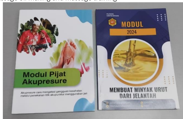
Figure 9. Memorabilia and provision of training modules

This service activity ended with the provision of souvenirs, modules for massage therapy and making massage oil. Indicators of success after evaluation with interviews for the elderly show positive results related to activities. The 48 elderly as participants there are about 10 people to give the perception that this activity can be directly practiced and useful. Similar activities need to be carried out as a sharing of knowledge and experience from Politeknik Harapan Bersama.