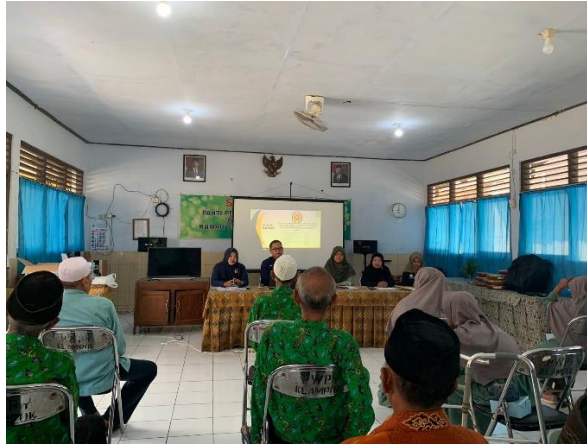
Figure 2. Introduction of the team and the initial process of community service activities

The incorporation of hands-on training in massage therapy education is essential for caregivers and residents to effectively understand the intricacies of the practice for later application. This two-stage approach, involving the creation of massage oils and their practical application under expert guidance, offers a comprehensive learning experience for aspiring therapists such as students.