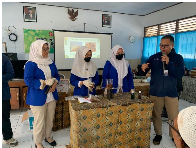
Figure 3. Providing material for making traditional massage oil from used cooking oil

In addition, the utilization of materials such as activated carbon for purification demonstrates a commitment to quality and purity in the final product. At each step of the manufacturing process, the residents and caregivers gained insight into the chemical and botanical properties of the components, enriching their understanding of how these elements interact to create a harmonious blend.