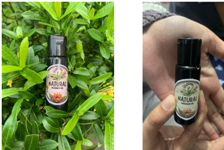
Figure 5. Massage oil product from used oil

Lemongrass contains the chemical citronellal, which has anti-pain properties. The distinctive properties of lemongrass can be made a mixture in the manufacture of massage oil (Kamkaen et al., 2015). In addition, chili also contains capsaicin which has hot properties suitable to be a mixture in massage oil to increase the heat effect (Kumari et al., 2018).