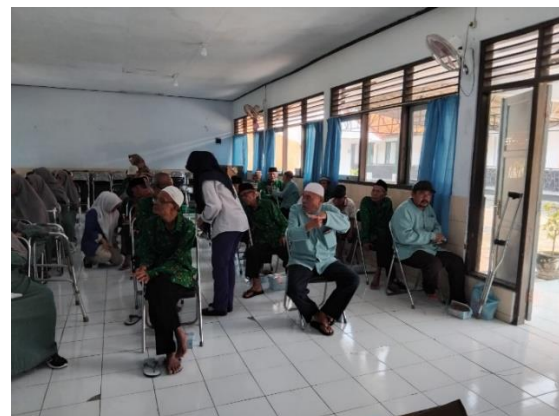
Figure 7. Massage assistance by students

Massage therapy using massage oil aims to provide a slippery sensation so as to reduce irritation during massage. One of the massage techniques given is pressing the three gods point channel by pressing the outside of the foot, about 4 fingers below the knee, just below the shin. The location of this point is in the center of the anterior tibialis muscle. This activity can be done by pressing the area for a few minutes or with the massage technique 20-30 times.