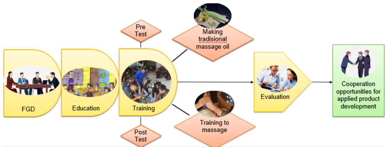
Figure 1. Activity plan of service activities

Each activity is coordinated with the manager and caregiver of the orphanage considering that the residents of the orphanage are elderly people who require special attention, especially physical activity that needs to be reduced. The activity plan is then divided into several stages which are presented in table 1 below.