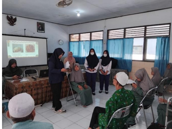
Figure 6. Participants were trained on how to do a massage

The involvement of volunteer participants in demonstrating massage practices fosters a collaborative learning environment, where the elderly residents of the retirement home can observe and replicate proper techniques under the guidance of experienced therapists. Moreover, the feedback and assessments provided by the therapists offer invaluable insights for the participants to refine their skills and address any areas for improvement.