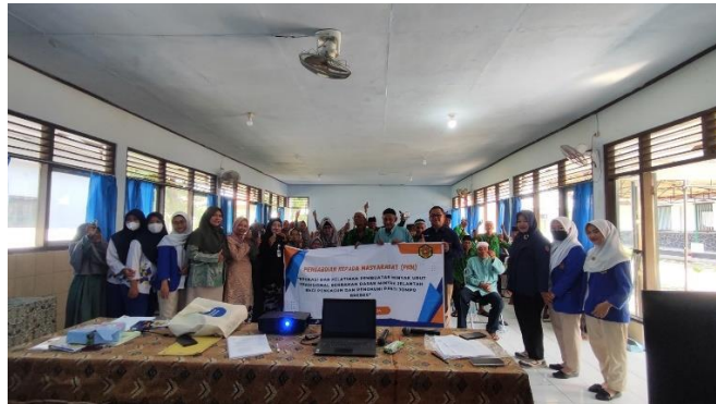
Figure 8. Participants of the massage oil making and massage training

In conclusion, combining theoretical understanding with practical application forms the cornerstone of effective massage therapy education. Through experiential learning experiences such as the two-stage training approach outlined, students not only acquire essential skills but also cultivate a deeper appreciation for the art of massage therapy.