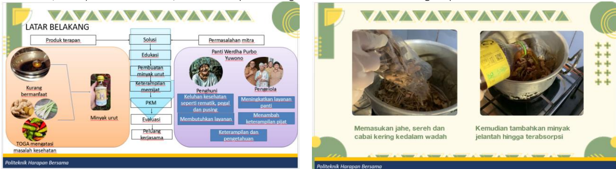
Figure 4. Materials for making massage oil

Used cooking oil has a risk of harming health because it still contains food residues from frying, besides that used cooking oil has undergone oxidation to produce free radicals, polycyclic aromatic hydrocarbons (PAH) which are carcinogenic. Used cooking oil can also trigger digestive disorders such as nausea, vomiting and diarrhea (Olanrewaju Alade et al., 2022). For this reason, alternative processing is needed such as making sequence oil.