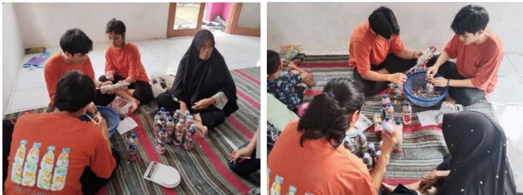
Figure 5. Product evaluation of the ecobrick made by the teams of residents of RW 10, Binong.

At the product assessment stage, several community teams still had difficulty working on the final part of the product. This is because the denser the ecobrick, the harder it is to push the plastic pieces into the bottle. This caused the ecobrick activity participants who were around 40 years old and above to need help from the college students as a community service team (Figure 5). At the final stage of making the ecobrick, the cut plastic pieces must fill up to the bottle cap.