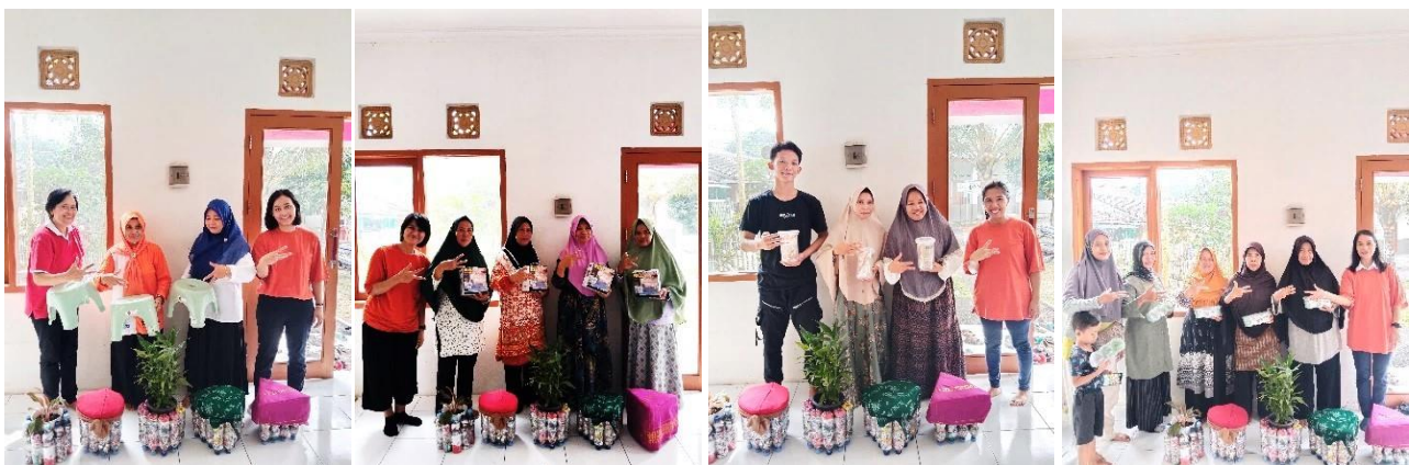
Figure 6. Prize giving based on the ecobrick product made by the teams of residents of RW 10, Binong.

The evaluation stage is carried out to measure the process of implementing the program carried out. The evaluation stage is carried out by various methods of data collection. Existing data collection techniques, for example in the form of tests, observations, questionnaires, interviews, document and artifact analysis, and monitoring the implementation of program evaluations (Diana, Nizar and Sari, 2023). In this community service activity, the evaluation stage was carried out with several data collection techniques, namely, product presentation, product assessment, and questionnaire filling. The evaluation stage is the stage carried out after the product presentation stage. After the evaluation, one of the college students read the results of the judging. After the winning team was announced, each team of residents was given a prize for the hard work they had done based on the product they had made. Prize giving and documentation are the final sessions in the product assessment stage (Figure 6).