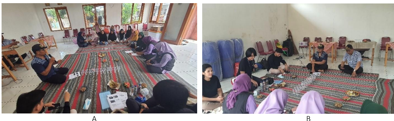
Figure 2. The education stage for the residents of RW 10, Binong. A) Opening by the RT head; 2) Explanation of the material for the benefits and how to make ecobrick.

The community education activity began with a welcoming speech and opening by the RT (Figure 2A). Education is an interactive process where an educator or presenter would deliver some materials to the participants (Pasalina et al., 2023). After the opening activity, it was proceeded with the presentation of material by the PkM team (Figure 2B). During the education activity, participants will follow a series of detailed explanations regarding the background of the activity, the impact of plastic waste on the environment, how to reduce the amount of plastic waste, the origin of ecobrick, functions, techniques, the processes of making, and the expected results of the community service activities carried out (Figure 2). Residents were explained about the impact of plastic waste pollution because plastic waste is one of the inorganic waste that cannot be degraded in nature (Putra & Yuriandala, 2010). Details of the ecobrick making process regarding how to select materials, prepare, and manage plastic waste properly, were also explained during the education session given to participants. The PkM team also showed examples of ecobrick products that had been made and could be used as useful products in everyday life.