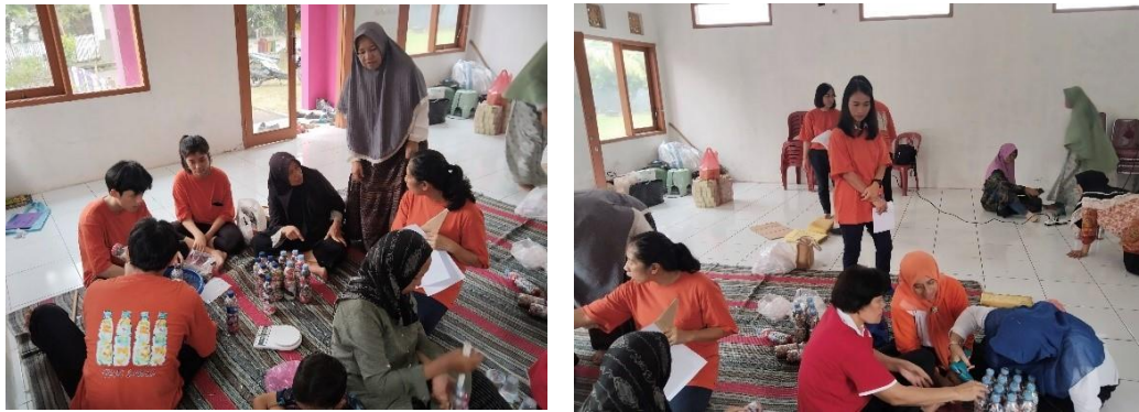
Figure 4. Product evaluation of the ecobrick made by the teams of residents of RW 10, Binong

At the product assessment stage, several community teams still had difficulty working on the final part of the product. This is because the denser the ecobrick, the harder it is to push the plastic pieces into the bottle. This caused the ecobrick activity participants who were around 40 years old and above to need help from the college students as a community service team (Figure 5). At the final stage of making the ecobrick, the cut plastic pieces must fill up to the bottle cap.