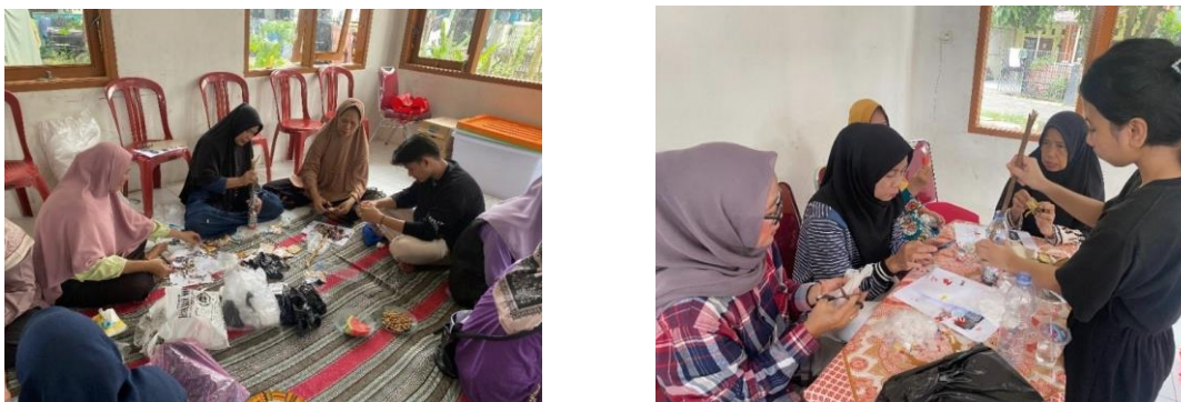
Figure 3. Stage of assisting the residents of RW 10, Binong in the activity of making ecobrick

The assisting stage is a stage carried out by the PKM team to see the progress of the ecobrick project of each team. In the assisting process, the college students were given the opportunity to help the women in working on the ecobrick. At this stage, the community team can weigh the finished ecobrick and re-evaluate them. If it was done correctly and filled the bottle according to its size, it will be given a weight label and marked. Even for bottles that were labeled as approved, it was still necessary to re-evaluate the density of the contents in the bottle. This was done to ensure the ecobrick bottle would remain sturdy and filled. At this stage, students also help with the process of cutting the plastics, inserting the plastic bits into the bottle, compacting them with wooden sticks, then weighing the ecobrick (Figure 3). At the mentoring stage, the community continues to be reminded to care about the environment and participate in the fight against plastic waste. This is because environmental issues have a direct impact on the people who live and live in the area. In addition, it is said that the issue of plastic waste generally has a very significant impact on every resident living in the area (Rusdiono et al., 2023). After that, when closing the assisting stage, the PKM team reminded the community team to plan the final product of the ecobrick that had been worked on.