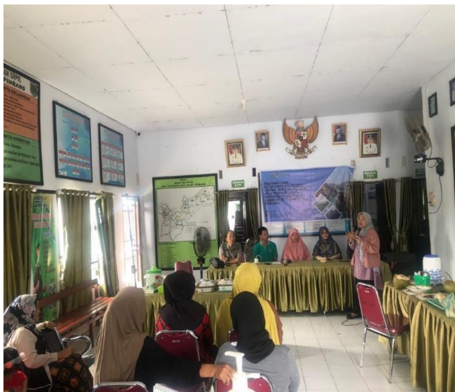
Figure 1. Presenter Training

From the training process carried out above, the resulting achievement dimension is the contribution of women to the economy that realizes the economic growth of the local community. According to UN Women, women's economic empowerment is a collective transformative process that denounces inequality and balances competition so that rights, access, ownership, control over resources, and income can be enjoyed fairly by women (Gantner & Quan, 2024). Thus, empowering women in Sipatuo village through training methods is a form of achieving collective economic transformation in maintaining food security. This training is no longer gender biased because it is based on the values developed by UN Women to achieve the 2030 SDGs. In addition, digital training for women not only represents inclusive technological progress but also represents a balance of access for women and men so that no party is left out of its role. Digital training is also a form of implementing the concept of empowerment by utilizing the values of technological progress. This is based on the concept of women's empowerment related to improving skills and knowledge (Pakuna et al., 2024) so that the implementation of training is a concrete manifestation of empowerment practices. Through digital training, the skills and knowledge of women's groups towards digitalization will be strengthened so that it can encourage them to increasingly innovate in utilizing digital technology in their tourism businesses.