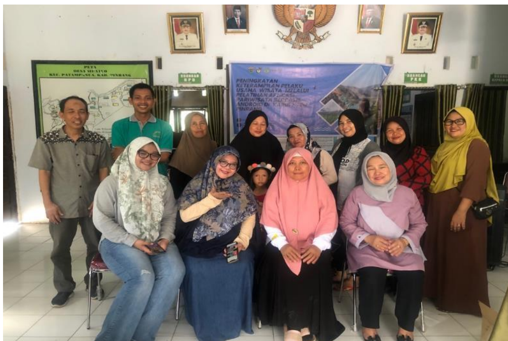
Figure 2. Training Participants

Gender equality, as stated in the SDGs goals, relates to respecting the differences and roles of women and men equally. Then, SDGs goal no. 5 also relates to the interaction between other goals (Advocates for International Development, 2022). Thus, fulfilling gender equality goals can contribute to other development goals such as poverty alleviation, economic growth, and reducing inequality. In practice, women have a crucial role because they are critical actors in fulfilling the equality aspect of sustainable development. Women play a direct role in accommodating demands for the fulfillment of rights and disparities that have so far placed women in inequality, thus hindering inclusive and sustainable development. In the economic sector, women can directly contribute to economic growth and security by increasing the productivity of entrepreneurial activities achieved through empowerment.