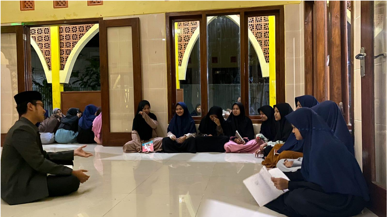
Figure 4. Muamalah Fiqh Teaching

The liqo mufrodat activity is one of the supporting activities which aims to improve students' ability to understand and master Arabic vocabulary. This activity is very important to instill enthusiasm for learning Arabic in a fun and interactive way (Ulum, 2022). Through liqo mufrodat, students can expand their vocabulary, which is not only beneficial in language learning, but also in strengthening their understanding of concepts. religious concepts conveyed in Arabic. By understanding mufrodat in depth, students can more easily access religious texts, both the Koran and Hadith, which mostly use Arabic. Therefore, liqo mufrodat is an effective means of instilling an understanding of Arabic as part of increasing their language intelligence and spirituality, which in turn can deepen their love of science and religion. Apart from that, through liqo mufrodat, students are also trained to communicate well in Arabic, which is very useful in everyday life and in understanding more deeply the teachings of Islam.