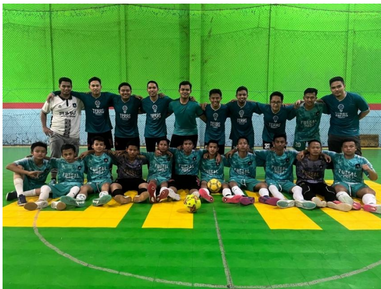
Figure 6. Futsal Match

After a series of community service activities at Muhammadiyah Boarding School, post-test carried out to evaluate the extent to which participants have absorbed and applied the knowledge taught. This post-test aims to measure changes in participants' understanding, skills and attitudes regarding the material that has been given, such as fiqh muamalah, Arabic and English, as well as other activities such as futsal. The post-test results will provide an overview of the program's effectiveness and become a basis for program improvements in the future. At stage closing , the community service team expressed its appreciation to all parties involved, including participants, teachers and those who supported this activity. This closing is also an opportunity to reflect on the program's achievements and ensure that the knowledge and skills gained can be applied in everyday life. It is hoped that this program will have a long-term positive impact, strengthen the relationship between the school and the community, and be the first step for future community service programs (Figure 8).