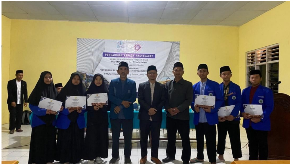
Figure 7. Post Test