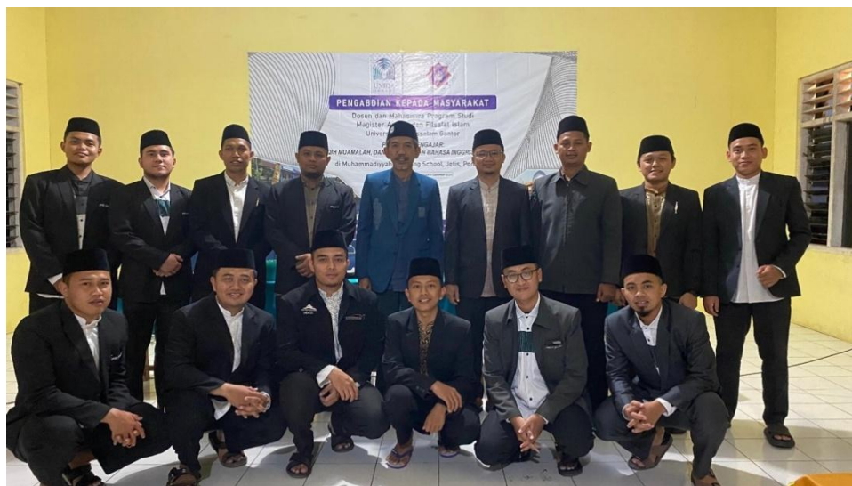
Figure 7. Closing

An integral part of Community Service activities is evaluation, which aims to measure the results of the training that has been carried out in teaching Arabic, English and muamalah fiqh (Agustianti et al., 2022). Evaluation is carried out through a post-test in the form of a practical exam to assess participants' understanding and skills after participating in learning activities (Ricci et al., 2019). Looking at the participants' post-test results, it can be seen that there is a significant influence in increasing language competence and understanding of muamalah fiqh. This improvement can be seen from the participants' skills in speaking and writing in Arabic and English, as well as their better understanding of the concepts of muamalah fiqh. Apart from that, participants also showed an increase in the practice of daily prayers and the application of religious teachings in daily life. They become more aware of the procedures for social interaction in accordance with the principles of muamalah fiqh, such as fair transactions, honesty and correct business ethics.