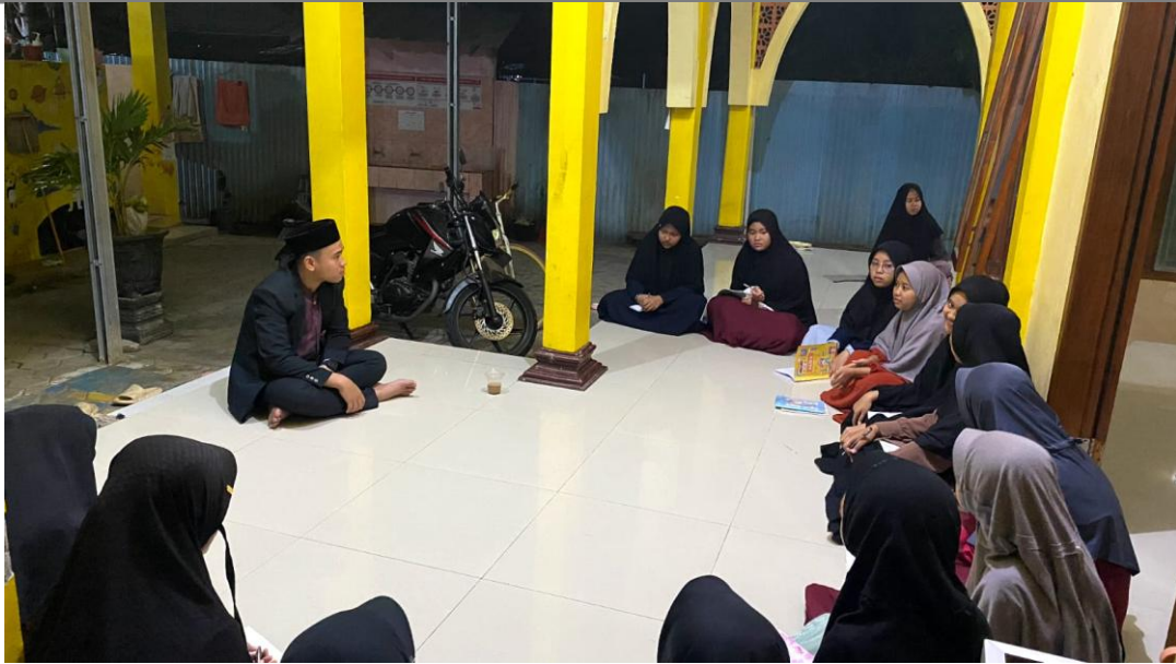
Figure 5. English and Arabic Language Teaching

Futsal as a community service program at the Muhammadiyah Boarding School is a form of activity that aims to develop physical skills, teamwork and a spirit of sportsmanship among students. This futsal activity not only aims to improve physical fitness, but also to teach positive values such as discipline, responsibility and mutual respect among the participants. In this community service program, futsal is used as a medium to build a sense of togetherness among students and between the school and the surrounding community. Through futsal matches, students are expected to develop technical skills in playing mini football, as well as strengthen the spirit of teamwork which is very important in social and academic life. (Figure 6)