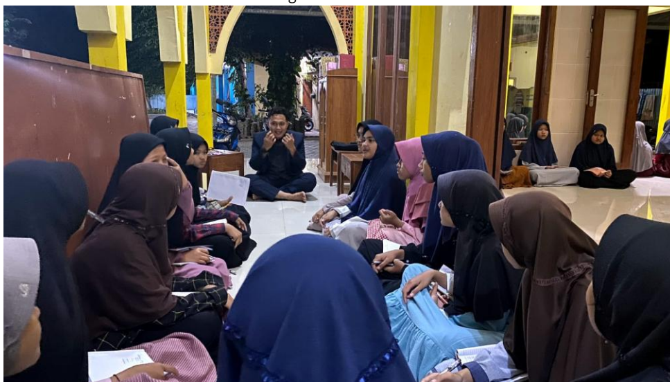
Figure 3. Liqo Mufrodat