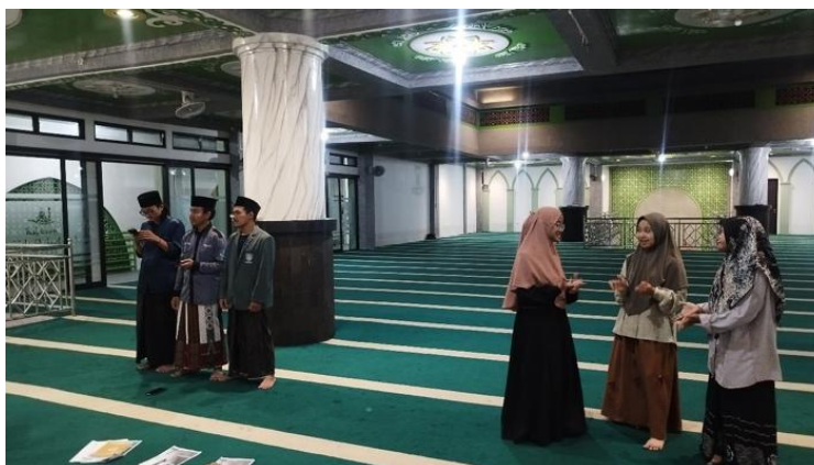
Figure 2. Some participants are practicing conversation.

The course took place at the Baitul Hakim Mosque, on the second floor. The course focused on basic English language components and skills. It was held once a week for 16 sessions, facilitated by experienced instructors from the English Department at UIN SATU Tulungagung. The instructional activities started on October 21 st , 2024, and ended on December 18 th , 2024. The course began with a pre-test and finished with a post-test. The photos below were taken during the service program's instructional activities.