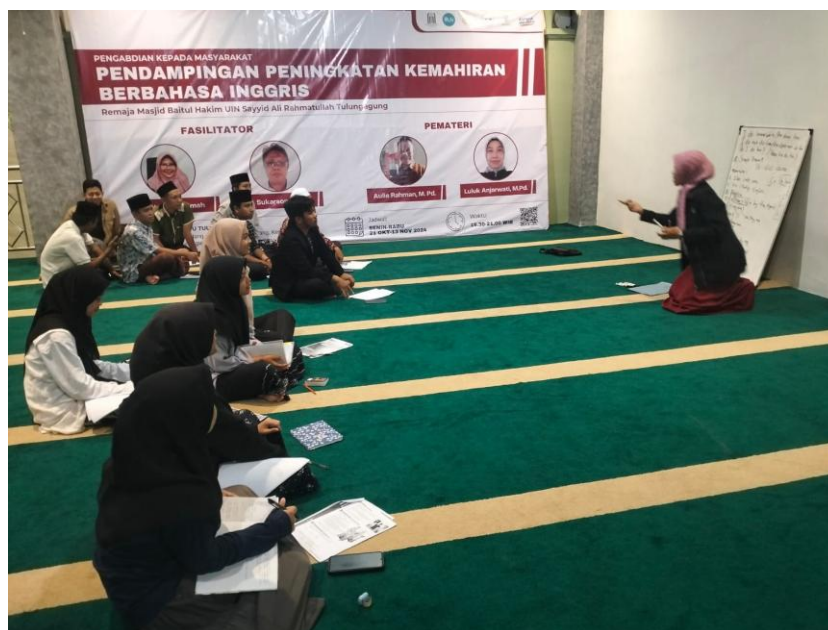
Figure 3. The participants are learning with the instructor.