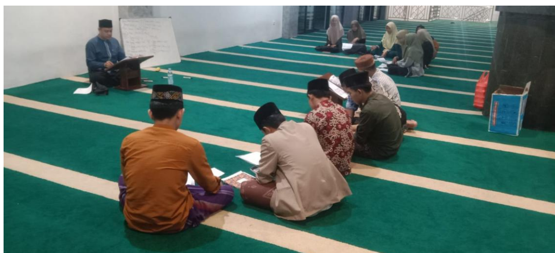
Figure 4. The participants are doing exercises.

Generally, the implementation of the short course encompasses the following: