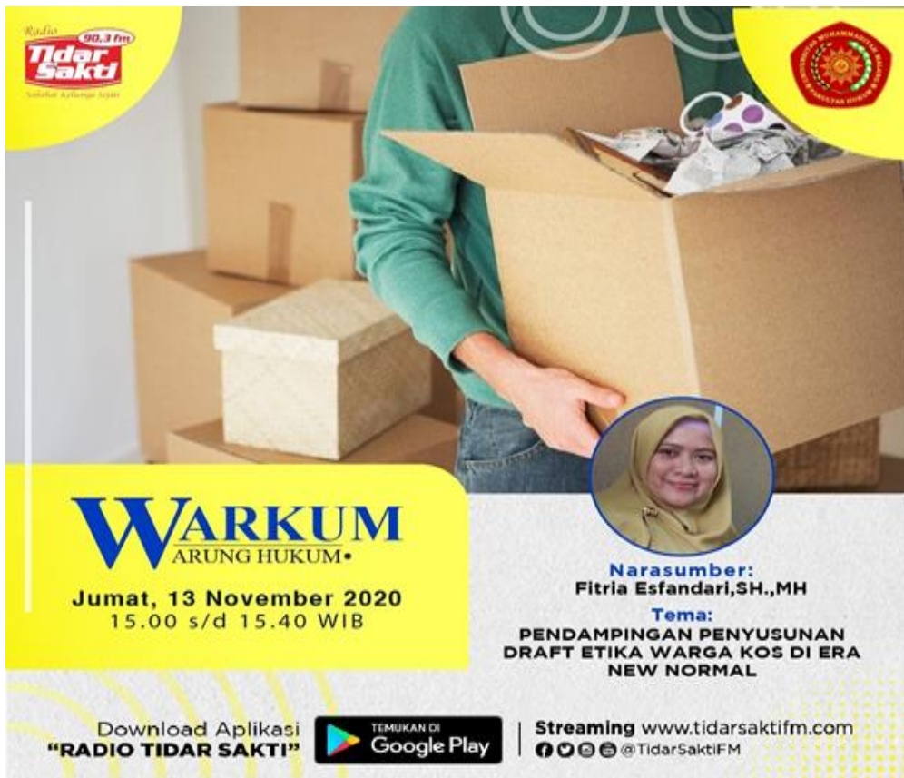
Picture 1. Leaflet of Socialization through Electronic Media Assistance in Preparing Ethics of Boarding House Residents in the New Normal Era

Finally, the drafting of the ethics of boarding house residents towards the New Normal era can be useful and is very likely to be developed in the future.