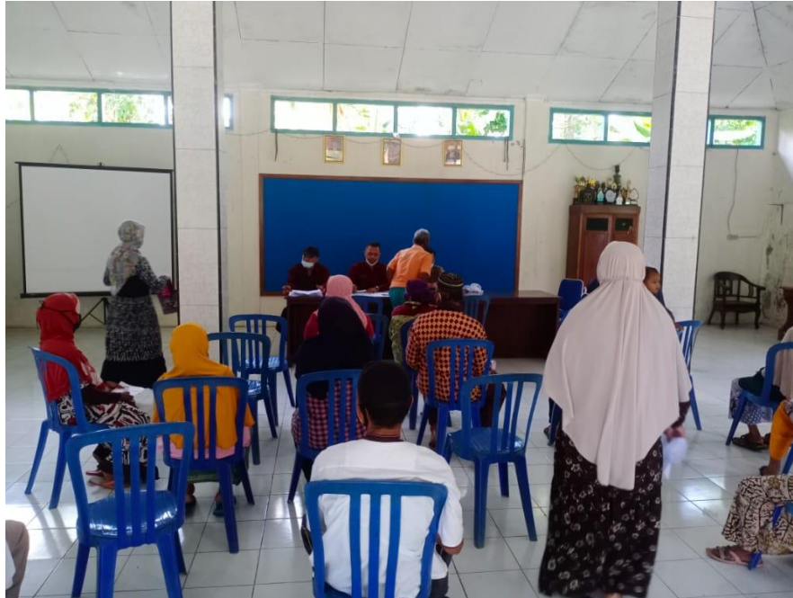
Picture 3. Discussion Session with Socialization Participants

possibilities for villages to manage their own governance and execute equitable development is intended to improve the welfare and quality of life of rural communities, reducing issues like regional inequities, poverty, and other socio-cultural issues.