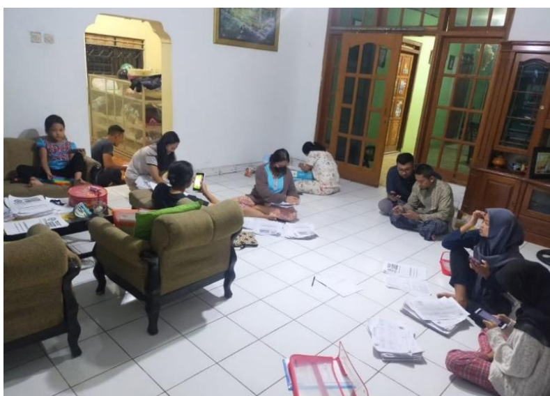
Picture 1. Coordination Process and Preparation of Activities Proses