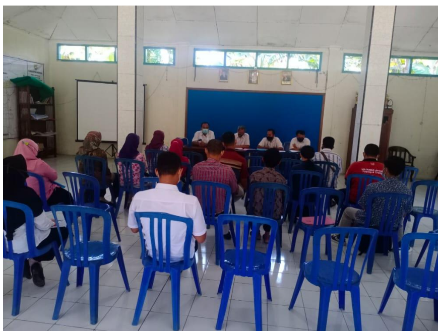
Picture 2. Submission of Material by the Service Team

Based on the service activities that have been carried out, there is a sustainability plan for the ongoing program, namely, Puguh Village can be independent through Community Empowerment and Development by creating a corruption-free village area.