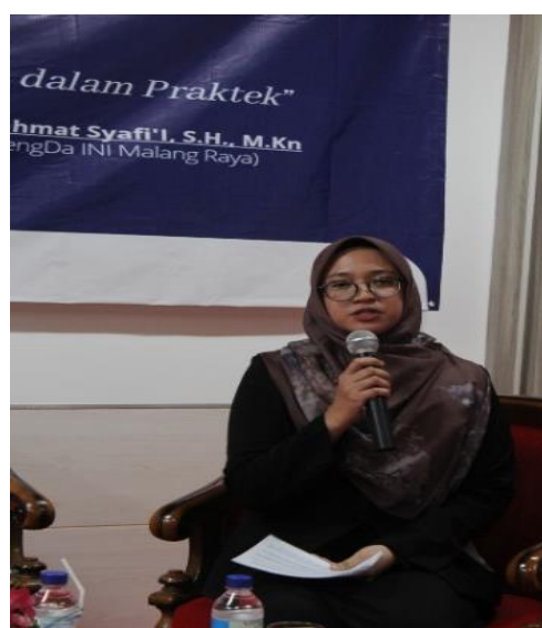
Figure 1. Material Submission Activities on Pawn Law Counseling