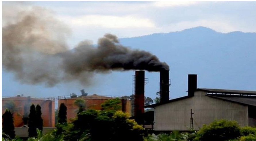
Picture 2. Air pollution caused by factories