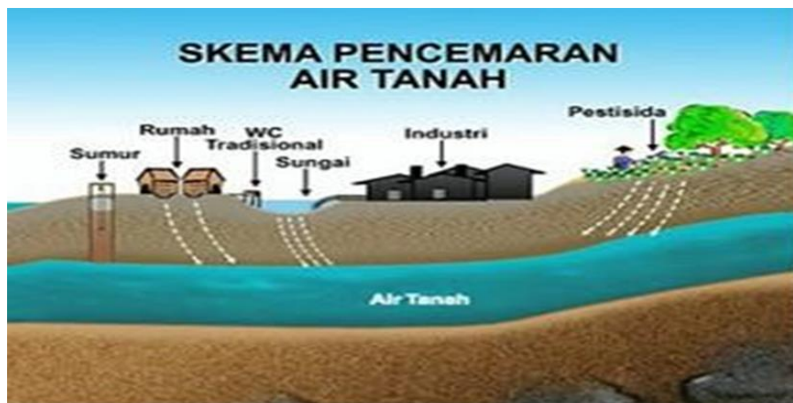
Picture 3. Water pollution caused by factories