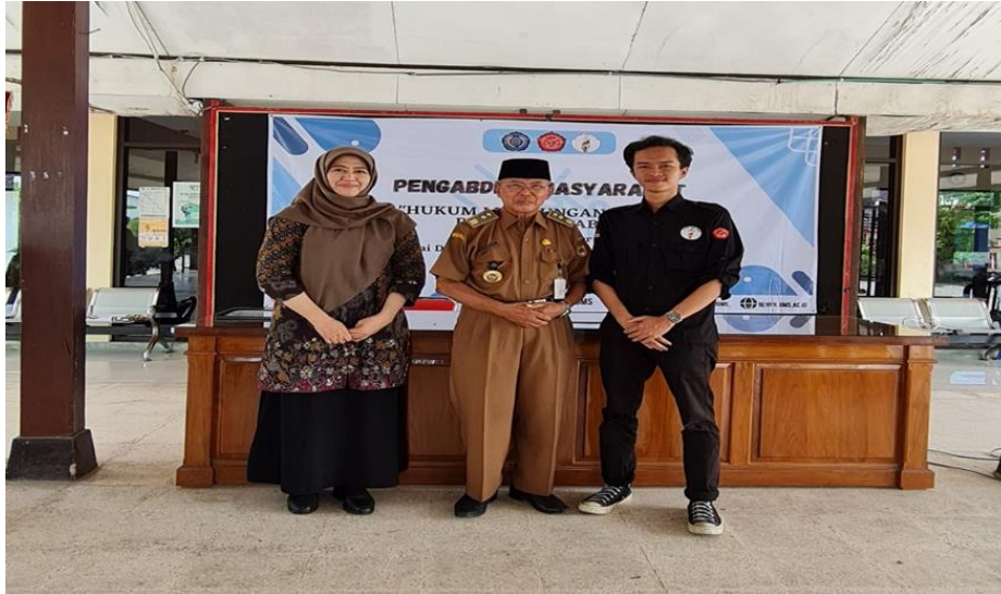
Picture 5. Team UMS with Head of Pondok Village, Grogol

from that, the Pondok Village Waste Care Community Group was formed whose task was to carry out waste awareness outreach directly to the community.