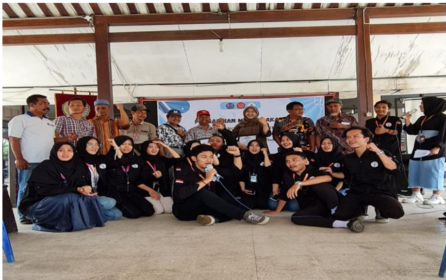
Picture 4. Socialization of Pondok Village, Grogol