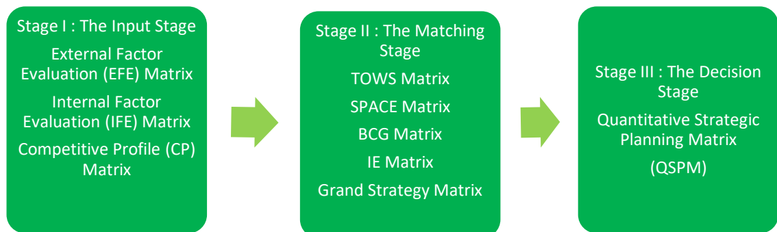
Figure 1. Strategy Formulation Analysis Framework Source (David ,2019 )

Regulation of the Minister of Health of the Republic of Indonesia number 4 of 2019 concerning technical standards for meeting the quality of basic services at minimum service standards in the field of hospital health . Provisions on Minimum Service Standards at RSJ Dr. H. Marzuki Mahdi is also regulated in the Decree of the President Director of RSJMM NO. HK.02.03/XXV.I/3131/2020 concerning Quality and Patient Safety Indicators, Work Unit Quality Indicators and Service Quality Indicators. In this case the performance of psychiatric inpatient installations is measured through Minimum Service Standards.