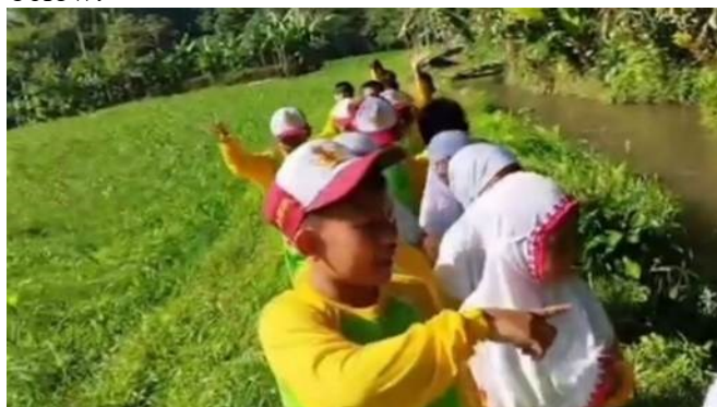
Figure 4. Outdoor learning in the environment around the school

The learning atmosphere becomes more interesting when students are involved in exploration activities outside the classroom, especially by exploring the natural surroundings of the school. Figure 4 below is a documentation of precious moments where students experienced firsthand the beauty and diversity of the nature around them. In an effort to provide real learning experiences, teachers invite students to utilize the potential of the environment around the school as a source of knowledge that is close to students. This is in line with the views of Derman (2023 & MacQuarrie (2018) who explain that one of the advantages of outdoor learning is that it is able to raise students' awareness of the environment around them. Through this activity the teacher hopes that students can optimize their competencies through environmental exploration activities to recognize the state of the surrounding environment. Through this exploration, students can also learn about plants, animals and various other natural elements that they may not be able to study in depth during classroom learning as shown in Figure 4 below.