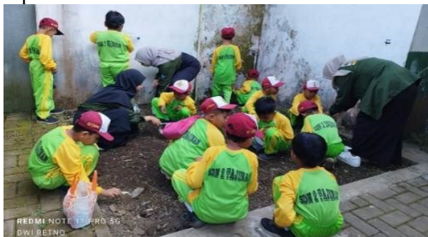
Figure 2. Planting activities in the school environment

Implementation of outdoor learning in schools is carried out by involving the environment around the school to introduce students to the nature they live in every day. Outdoor learning is carried out with the aim of facilitating students' physical, emotional, attitude and motor skills development. Outdoor learning at SDN 2 Tajinan has been carried out with various activities such as activities that take place in the school environment, cultural places and educational sites such as the following.