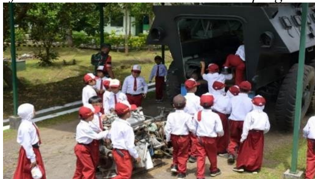
Figure 3. Outdoor learning at the arhanud education center

“Students not only learn from books, but they experience learning with the natural surroundings through exploration and direct interaction. “It is also easier for us as teachers to observe student progress in detail.”