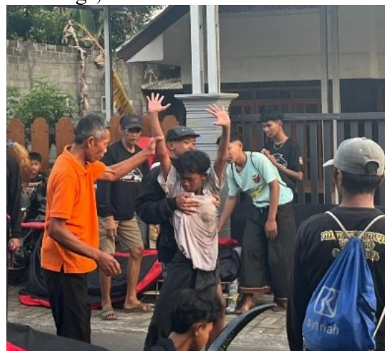
Figure 5. Kalapan

The next stage is the sacred element seen in the eighth ritual which displays the phenomenon of trance. The interview data states "Not everyone can, only those who are able to interact with the object" (Interview of the owner of the studio in Tawangrejeni Village, 2025) the owner of the studio explained that only certain individuals are able to interact with transcendent beings, observations show this transcendental moment.