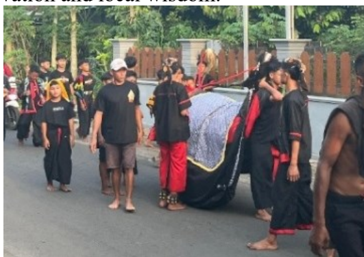
Figure 3. Mberot Players' Clothing and Attributes

The documentation in figure 2 shows the arrangement of offerings such as coconut, banana, jambe, tape, eggs, frankincense, and seven kinds of flowers. In the selection of clothing and equipment, observations showed dancers wearing dominant black clothing with red accents and leg bell attributes, which was reinforced by the documentation of costume photos. This data indicates that clothing symbols play a role in strengthening the value of cultural preservation and local wisdom.