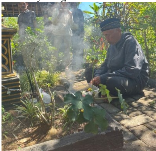
Figure 6. Spot Cleaning in Punden

The post-performance stage is marked by a closing prayer and cleansing of the place. Based on the results of the interview, after the eighth procession was over, all actors and supporters of the activity performed a closing prayer as an expression of gratitude for the smooth running of the event. This prayer not only serves as a formal ritual, but also as a form of respect for the ancestors and the transcendent forces that are believed to have kept the performance going. "After completing the kalapan activity, we regain consciousness like ordinary humans, then close with prayer" (Interview of the Owner of the Mberot studio in Tawangrejeni Village, 2025). Observations in the field showed that the closing prayer was carried out solemnly, led by coach Mberot . At the end of the activity, it is necessary to 'clean the place' in the village punden. The observation shows respect for the environment led by village elders.