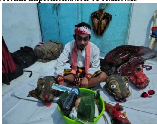
Figure 2. Opening Offering Ritual

The opening ritual stage in the form of slametan and the presentation of ucok will show a strong spiritual dimension. The interview explained the function of the ritual as communication with ancestors and spirit creatures "Ucok will be a need for spirit creatures, containing coconut, banana, jambe, tape, eggs, frankincense, seven kinds of flowers" (Interview of the owner of the Mberot studio in Tawangrejeni Village, 2025), observations show the solemn implementation of slametan.