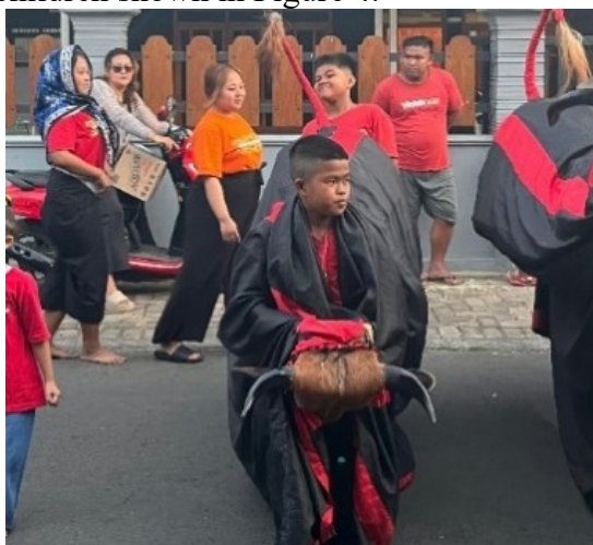
Figure 4. Elementary-school Mberot Performers

The stage of the performance shows the integration of pencak silat movements with dynamic bull movements. Observation data shows an elementary school-age Mberot perpetrator who is demonstrating a typical swinging, jumping, spinning movement, documentation data that strengthens the existence of traditional art elements carried out by elementary school children shown in Figure 4.