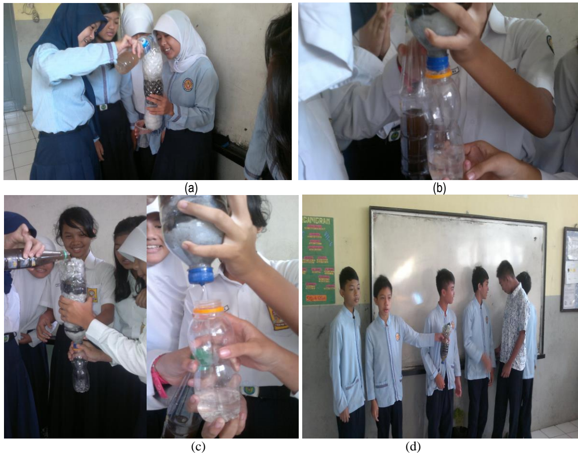
Figure 1. Documentation of product presentation and trial in (a) group A, (b) group B, (c) group C, and group D

Based on the findings of this study, PjBL provides optimal benefits for developing student creativity. Creativity as an indicator of high creative thinking skills is a competency that must be optimally empowered in the current era (Guo, 2016; Lee & Carpenter, 2015). Together with critical thinking, communication and collaborative skills, creative thinking skills are classified as 4C competencies (Guo, 2016) which are seen as one of the main competency groups in the 21st century (Lee & Carpenter, 2015). Given the high implementation of conventional learning in various schools in Indonesia, socialization and innovative learning training such as PjBL is necessary carried out continuously.