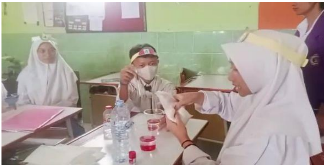
Figure 2. Students try to practice according to the instructions from the worksheet