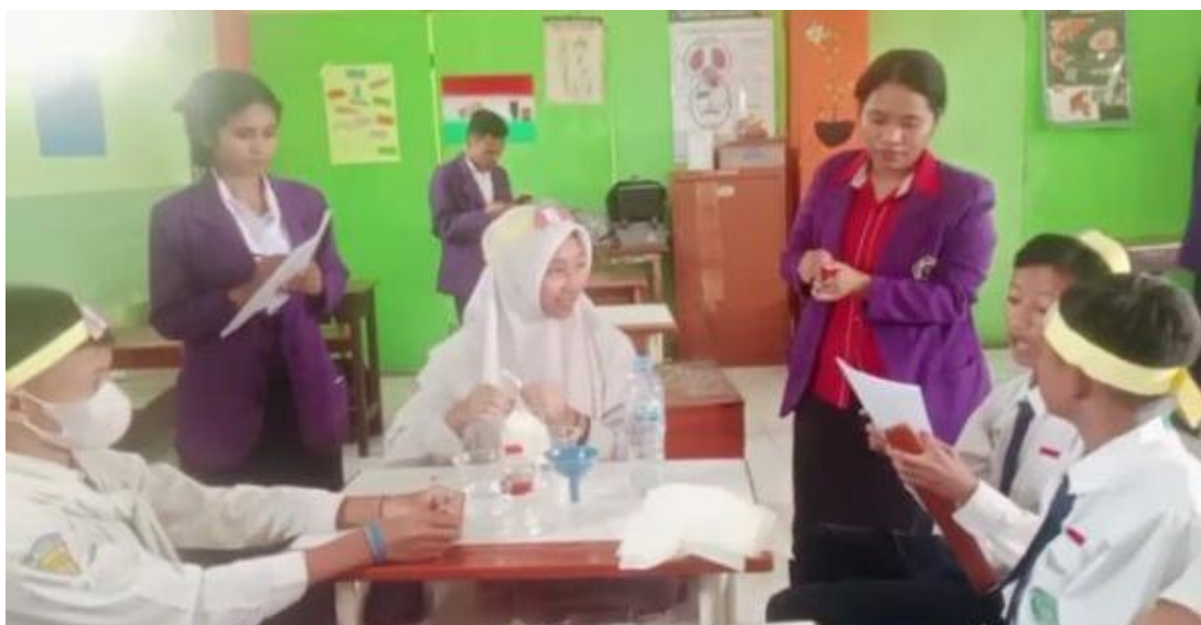
Figure 3. Students do practice and are accompanied by the teacher model, and two other student prospective teachers make observations of learning