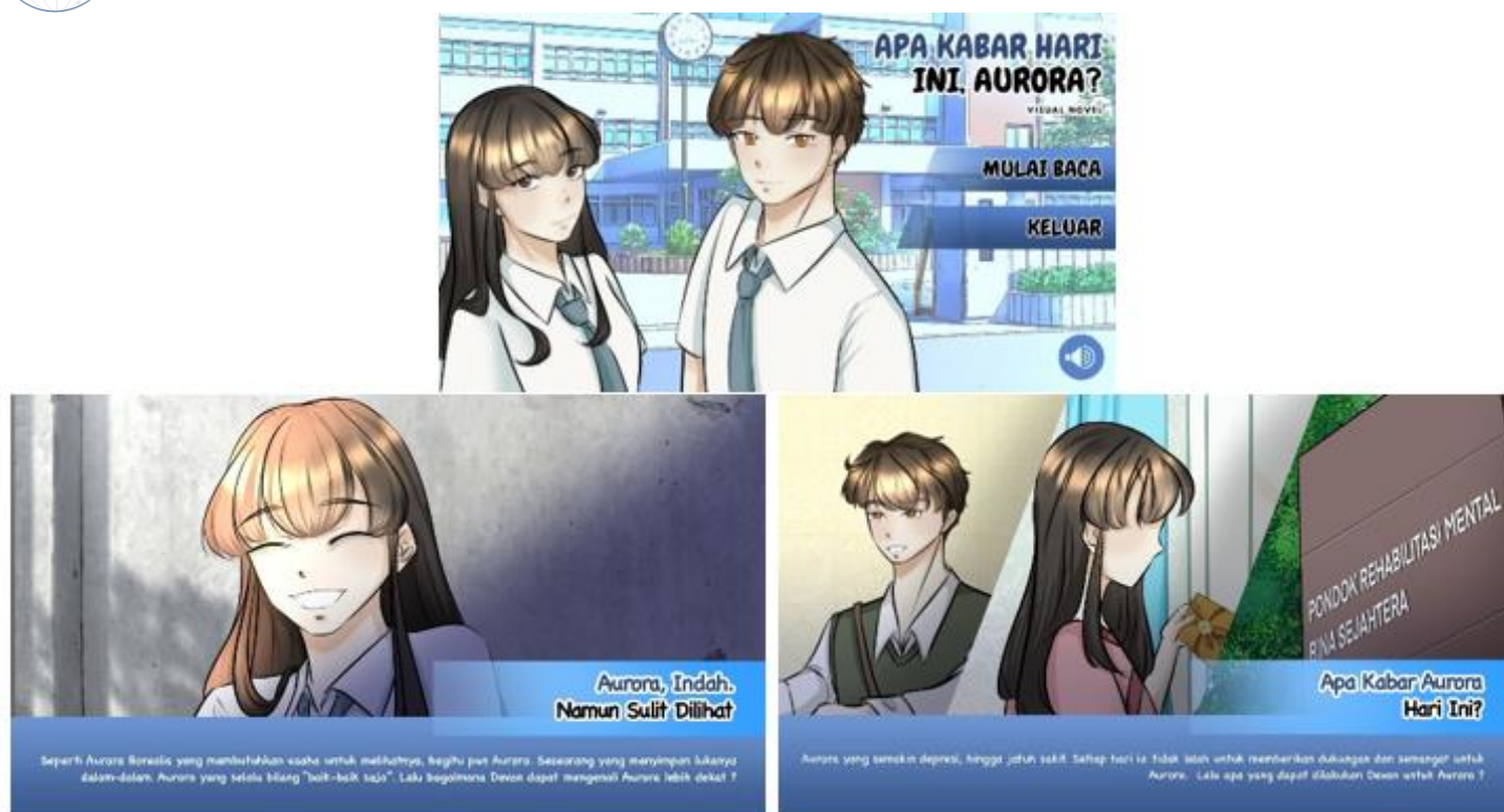
Figure 2. E-comic nervous system

Media validation obtained 100% results as listed in Table 6, but there are some suggestions for media such as adjusting the ratio on various smartphones and the ease of installation from the application model to the website so that it is easy to use on all devices.