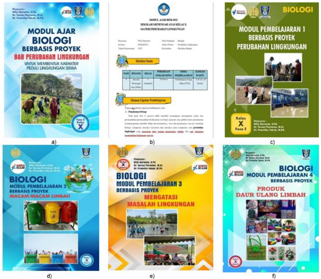
Figure 1. Teaching Module Package (a) Teaching module cover page; (b) Teaching module content page; (c) Learning module cover page 1; (d) Learning module cover page 2; (e) Learning module cover page 3; (f) Learning module cover page 4.

researchers includes topics of the environmental change with validation results as shown in Table 4 . Based on the results of the validation of the teaching module carried out by the validators, the average result of the overall validation score is 3.48 which is categorized as valid. So that the final results of this validation indicate that this teaching module can be used in the learning process. The results of validation from the content aspect of this teaching module obtained an average score of 3.4 from the two validators, which these results indicate that in this teaching module the preparation format is in accordance with existing rules and regulations. The learning activities designed also meet the eligibility requirements to be applied in learning and use supporting teaching materials that are also feasible. In terms of language feasibility, the average result of the two validators is 3.75, which indicates that the language writing in this teaching module is very feasible if used in the learning process. Educators can make good learning plans according to students' conditions as preparation before learning.