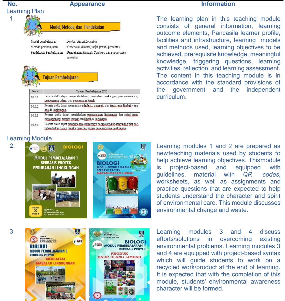
Table 3. Description of the display of the teaching module device

Based on the results of the validation of the learning module / teaching material media carried out by the validators as in Table 5 , it can be obtained that the average result of the two validators is 3.52 which is categorized as valid. This validation result indicates that this teaching module can be used in the learning process. Judging from the aspect of the feasibility of the content of this learning module, it obtained an average score of 3.46, including the identity and writing format of the learning module. These results indicate that the content of this module is in accordance with the PjBL syntax and contains environmental material. In terms of display feasibility aspect, the average score is as follows 3.7 which includes the suitability of the cover with the content and completeness of the media used so that it can be concluded that the appearance of this learning module is attractive and quite complete. Based on the aspect of language feasibility, an average score of 3.5 was also obtained, indicating that this learning module is easy to understand.