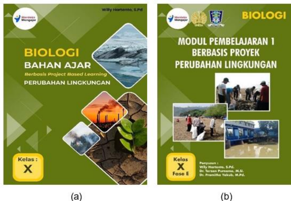
Figure 2 Teaching module: (a) before revision; and (b) after revision

The improvements to the learning media after the validation process show that the images in the cover of the teaching module look small and are difficult to use to see the characteristics of the environment (Figure 3). The results after revision become better for students to see.