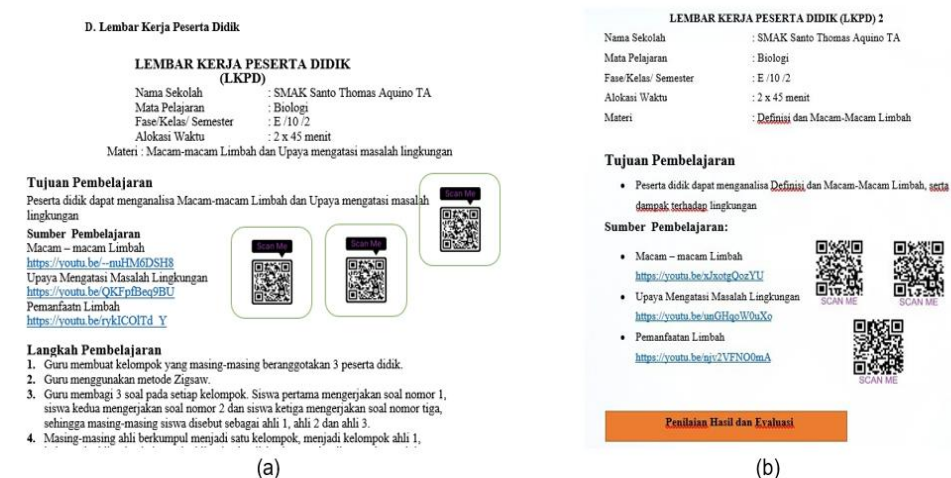
Figure 3. Student worksheet: (a) before revision; and (b) after revision