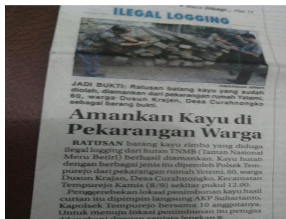
Fig.4 The police force of Jember is securing the woods from TNMB

The human that at first consider the forest as a sacred place with spiritual values to keep the harmony living which causes humankind respect and protect, nowadays has changed to more rational resulting in the belief that everything exists for the individual purposes. Therefore, the human becomes the conquerer and exploit all natural resources, sell it to the free market. The trees trunk burning to kill the trees slowly is a form of the anthropocentric practice. P Illegal logging, crops planting that is not recommended by TNMB is the implementation of anthropocentric culture, which strengthens the commodification process.