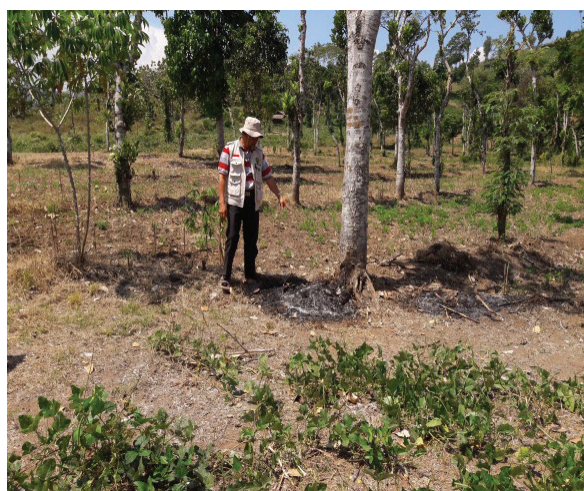
Fig.. 3. The dry and arid rehabilitation zone, the trees are burnt and dying.

The anthropocentric let human to do anything it takes for the current needs, especially economy, and leave the future alone without any concern. This belief will harm nature and result in natural damage in the future. People with anthropocentric ideology does come from not only well-educated level but also the poor as they are willing to do the same action without any consideration to damage the environment and nature. The following is rehabilitation zone that looks dry and arid, the protected trees are burnt and dying.