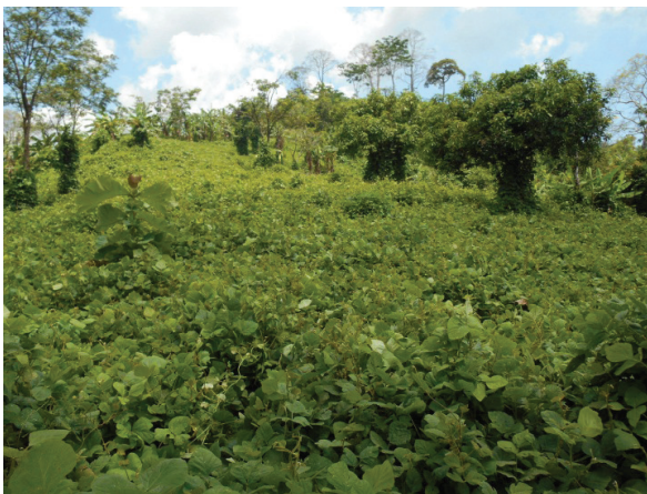
Fig. 2. Market intervention on farmers' choice to cultivate koro PJ crops.

Yuli, as the chief of Andongrejo farmers group, believes that involving broker is a common mechanism for land production. In short, this slight aspect is a peak of grand mechanism that change and mobilize the economic field of farmers in rehabilitation zone, namely market, and commodification. What farmers believe as affording the family has expanded the meaning of commodity or having potential products. This situation causes the existent of a particular mechanism to distribute the commodity from the rehabilitation zone to support the farmers' activity. The following is a picture of market intervention in TNMB area, which determines the farmers' crop cultivation, namely koro PJ , which actually is prohibited by TNMB.