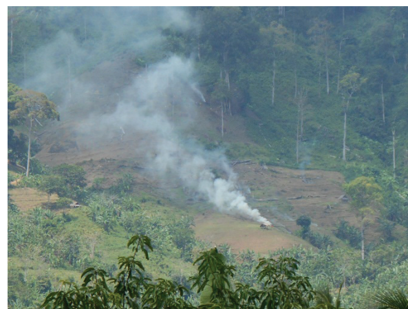
Fig.1 Crops farmer expand the farming land by planting more crops and burning the forest

People get more farming land by cutting down trees in a forest, burning the wood, crops planting, area looting, moving the pathok (land sign), and selling the area to other farmers. Competition among farmers to get more area occurs by getting more members to work in the rehabilitation zone. Some signs indicate the farmers need more farming land such as planting crops, uprooting the protected plants, keeping the land by rejection towards seeds from the TNMB, and planting forbidden plants by TNMB. The following is a figure of land expansion by planting crops: