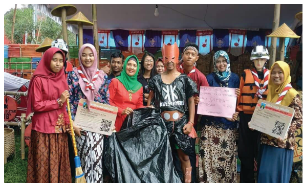
Picture 4. Some People Help Kresek Man

Kresek Man action collecting trash unwittingly affects the people around him. At least, groups of school children and many people from both visitors and bazaar participants imitated and carried out the same actions with Kresek Man. Not only in one location, but Kresek Man also continues to move to another location and occasionally rests. The action was carried out for approximately 2 hours and ended at 6 p.m.