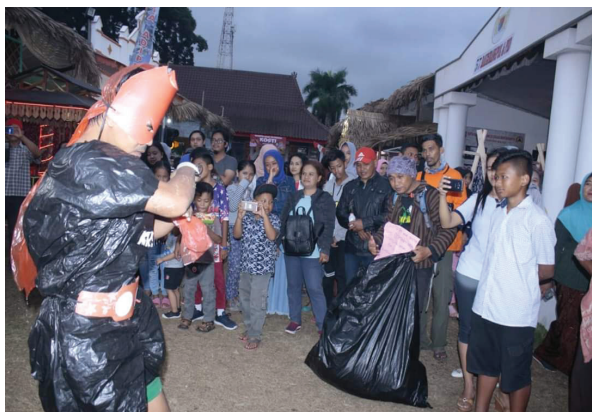
Picture 3. Kresek Man Action

Kresek Man action collecting trash unwittingly affects the people around him. At least, groups of school children and many people from both visitors and bazaar participants imitated and carried out the same actions with Kresek Man. Not only in one location, but Kresek Man also continues to move to another location and occasionally rests. The action was carried out for approximately 2 hours and ended at 6 p.m.