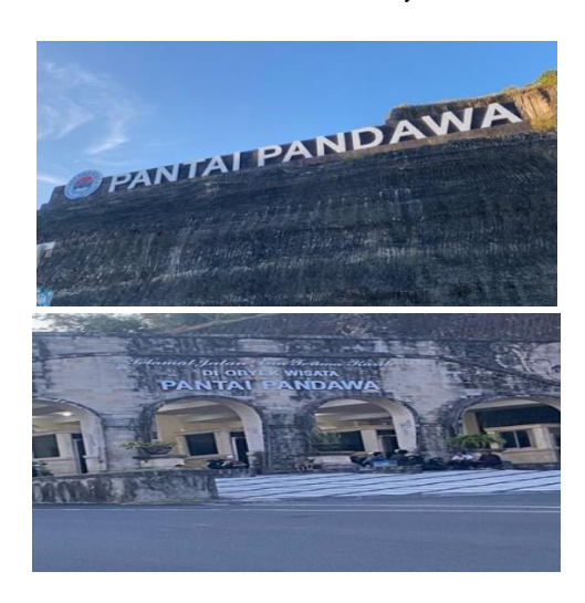
Figure 4 Sign of Pandawa Logo and Writing