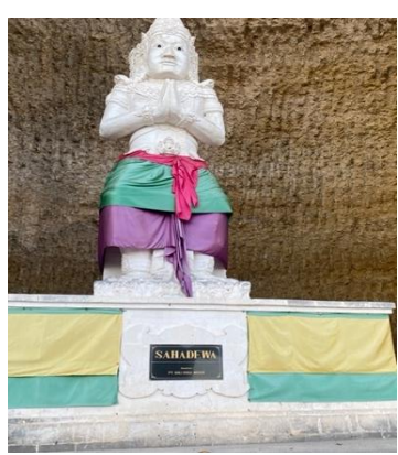
Figure 3 Sign of Panca Pandawa

The image above shows six different markings in each section. The sign describes the interaction of the various choices made in matrix 1. The sign that is displayed at the same time provides information about the naming of the five Pandava characters in the Mahabharata story. The sign displayed is in the Indonesian language. The choice of language used in the outdoor sign is Indonesian containing the names of the Panca Pandawa characters and their mother, Dewi Kunti . Indonesian is still an option in the outdoor sign because the marketing target for Pandawa Beach attractions is domestic tourists who come from outside areas. The Indonesian language used in these outdoor signs can be seen in the choice of vocabulary that appears in each sign, such as the names of the characters, Dewi Kunti , Dharmawangsa , Bima , Arjuna , Nakula , Sahadewa then added the other vocabulary "donatur" which includes the Indonesian language.