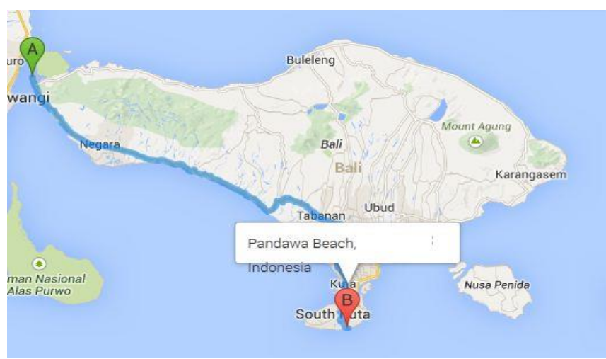
Figure 2 Pandawa Beach

Based on the data presented in this analysis, it can be determined that the nature of this research is qualitative. The objective of this study is to ascertain the cultural portrayal employed to promote a specific tourist location. The major data source for this analysis consists of outdoor signs located in the vicinity of Pandawa Beach, including billboards, place names, building names, statue names, and other relevant signage. There are 20 outdoor signs were analyzed in this study. The data collection method and strategy proposed by (Creswell, 1998). The method of this research is field research by observation method in Pandawa Beach. The technique of collecting data by checking the list, interviewing with the local community, and documenting the outdoor signs using a digital camera. The participants of this study are Traditional figures of the Kutuh Village community who know the history of Pandawa Beach. The method of analyzing data in this study is the qualitative method which is divided into some technic such as quantification of qualitative data and subject interpretation data.